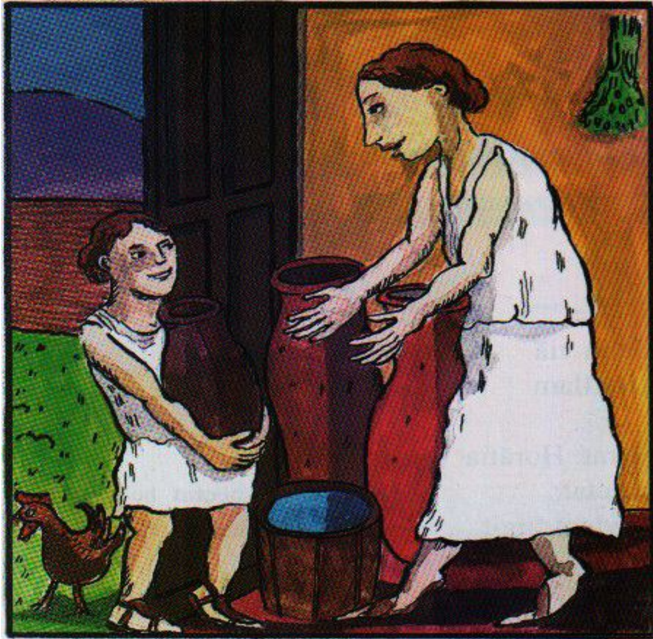
Horātia Scintillam iuvat; aquam in casam portat.