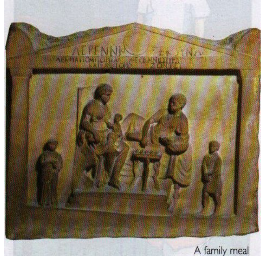
A family meal