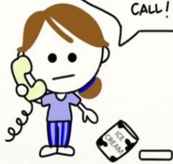
... the following Tuesday