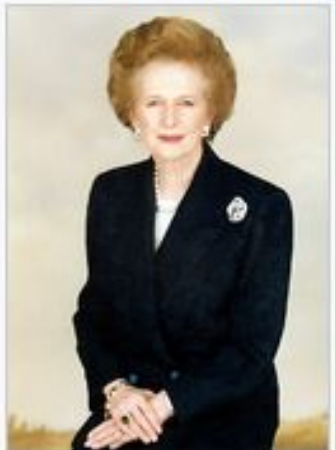
Margaret Thatcher, Somerville College