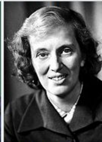
Dorothy Hodgkin, Somerville College