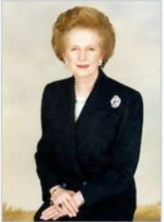
Margaret Thatcher, Somerville College