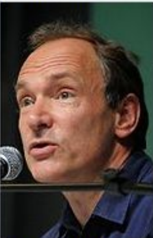
Tim Berners-Lee, The Queen's College