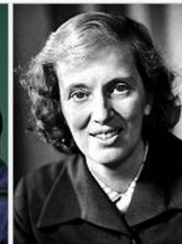
Dorothy Hodgkin, Somerville College