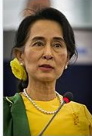
Aung San Suu Kyi, St Hugh's College