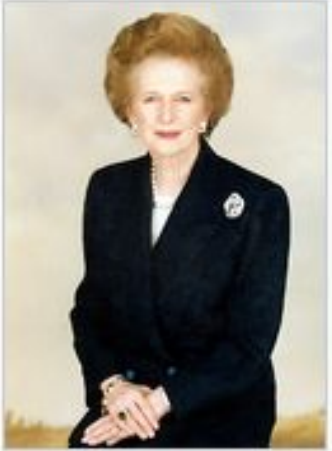
Margaret Thatcher, Somerville College