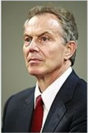
Tony Blair, St John's College