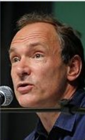
Tim Berners-Lee, The Queen's College