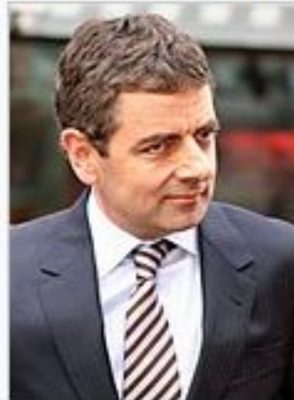
Rowan Atkinson, Queen's College