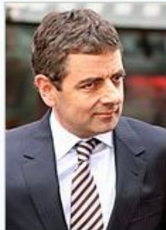
Rowan Atkinson, Queen's College