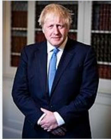
Boris Johnson, Balliol College