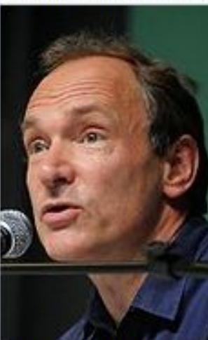
Tim Berners-Lee, The Queen's College