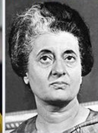
Indira Gandhi, Somerville College