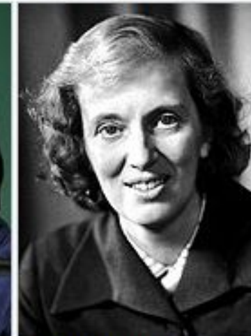
Dorothy Hodgkin, Somerville College