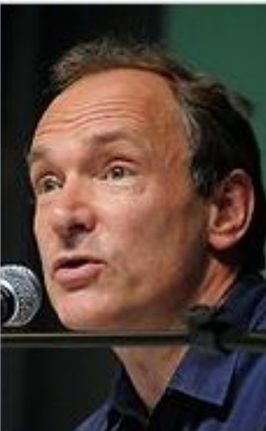
Tim Berners-Lee, The Queen's College