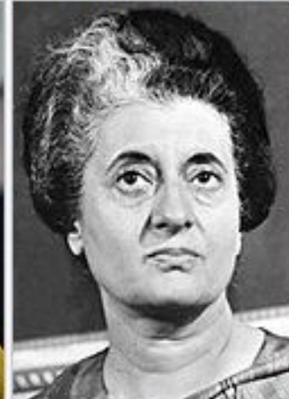
Indira Gandhi, Somerville College