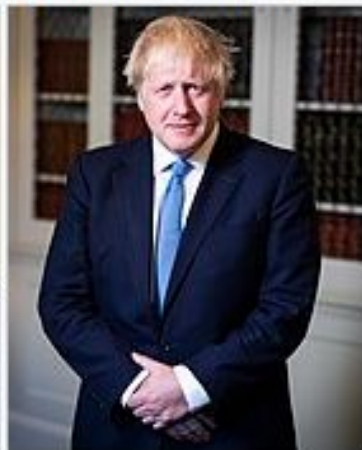
Boris Johnson, Balliol College