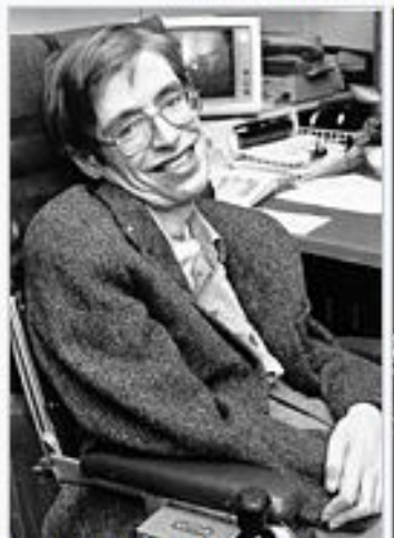
Stephen Hawking, University College