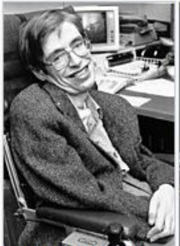
Stephen Hawking, University College