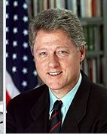
Bill Clinton, University College