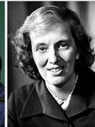
Dorothy Hodgkin, Somerville College