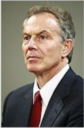
Tony Blair, St John's College