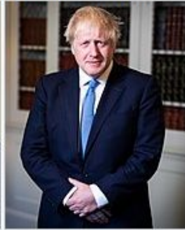
Boris Johnson, Balliol College