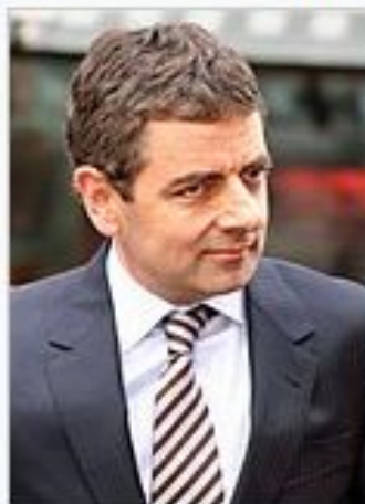
Rowan Atkinson, Queen's College