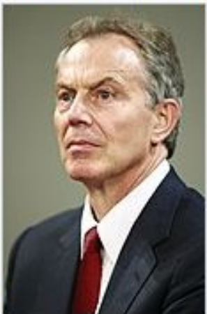
Tony Blair, St John's College