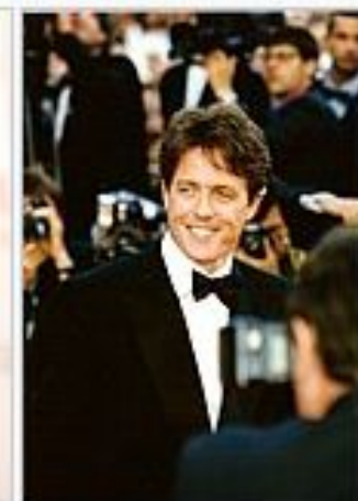
Hugh Grant, New College