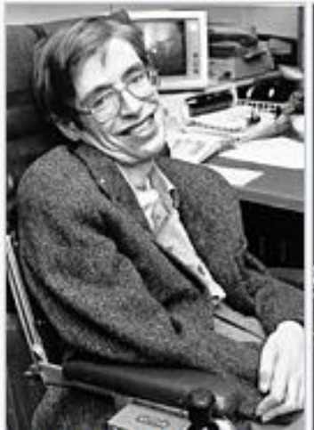
Stephen Hawking, University College