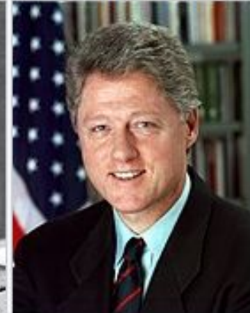
Bill Clinton, University College