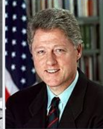
Bill Clinton, University College