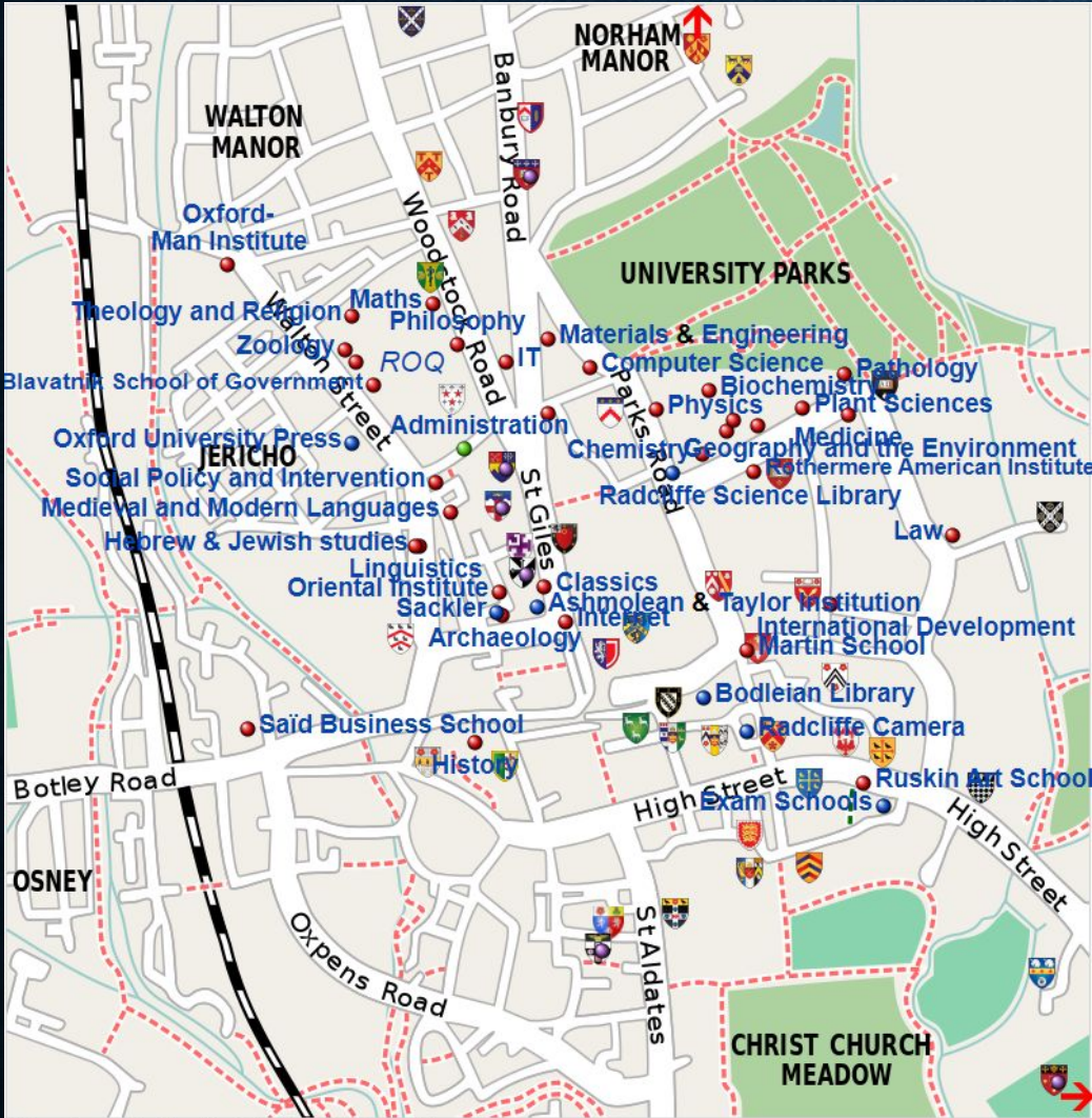
University of Oxford Faculties & Facilities (Central Oxford)