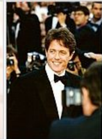
Hugh Grant, New College