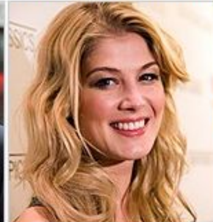
Rosamund Pike, Wadham College