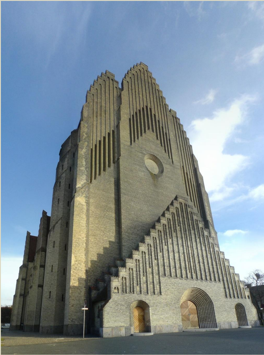
Grundtvig Church in Copenhagen