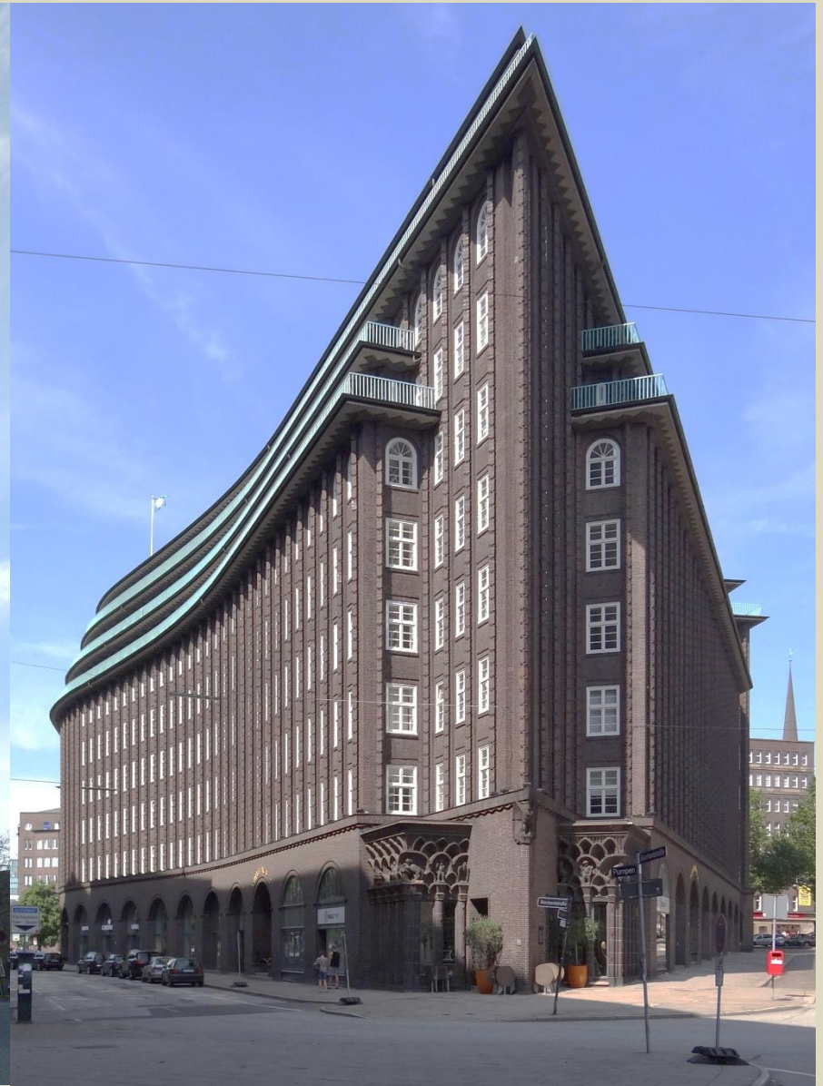
Office building Chilehouse in Hamburg