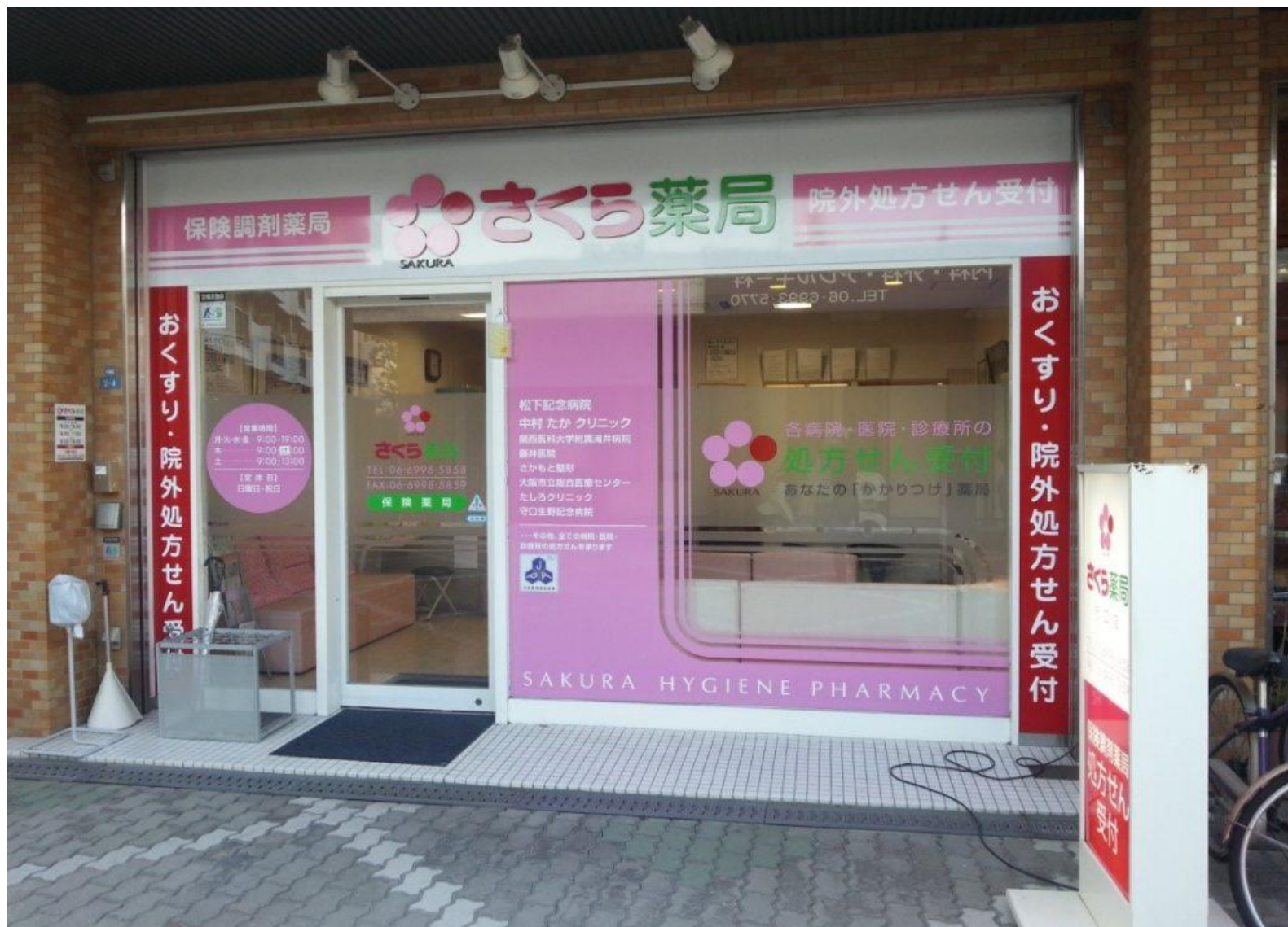
Pharmacy in Japan