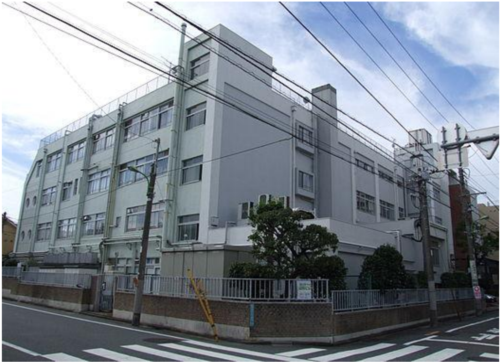
Tokyo University of Health