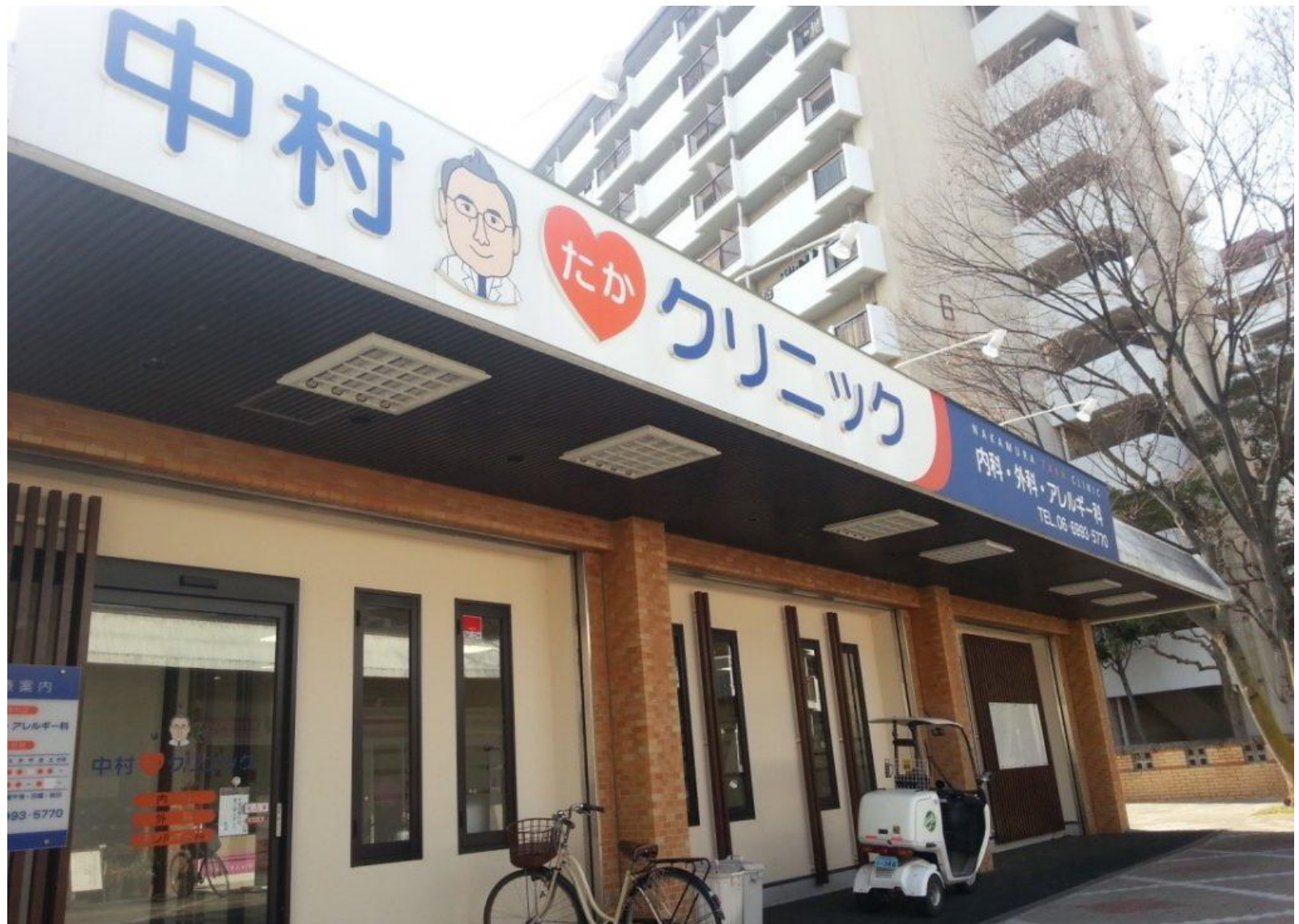
Japan Private Clinic