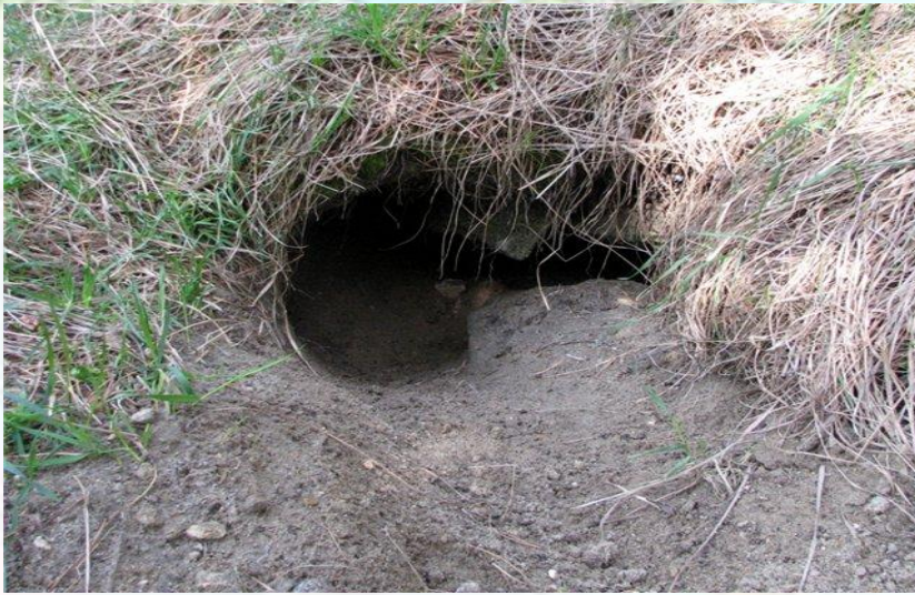
Hole Lake, forest