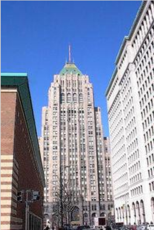
The Fisher Building, located in the City's New Center area, home to the Fisher Theatre.