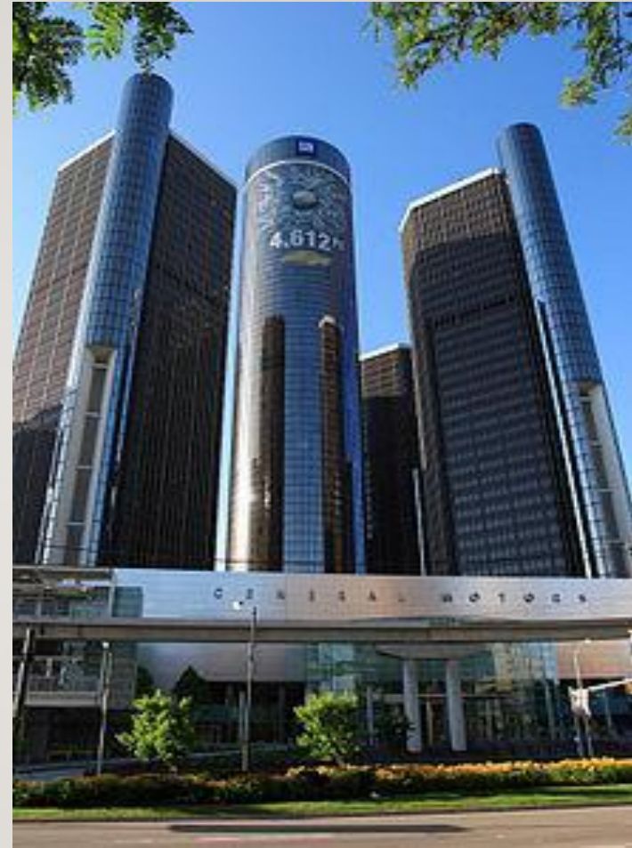
The Renaissance Center is the headquarters of General Motors