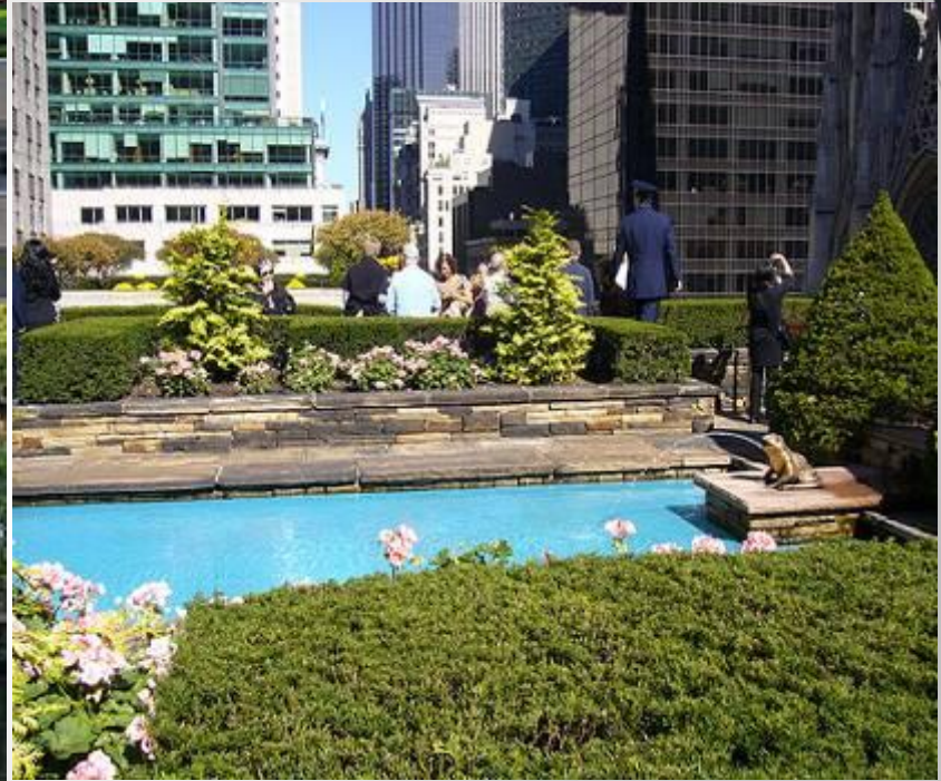
ROOF GARDEN OF ROCKEFELLER PLAZA BUILDINGS