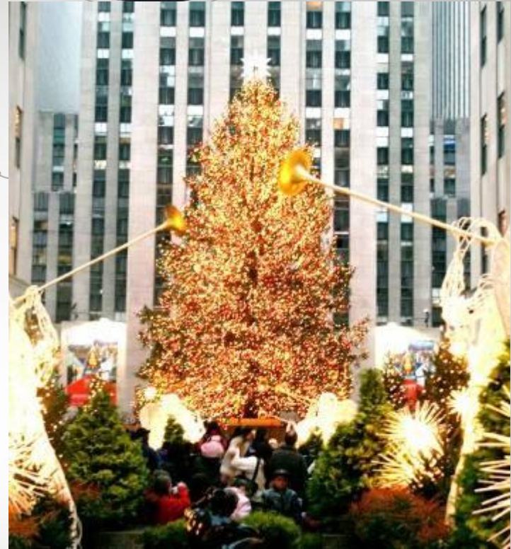
The famous Rockefeller Center Christmas Tree