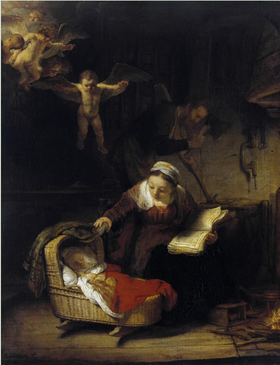
«Holy Family», 1645