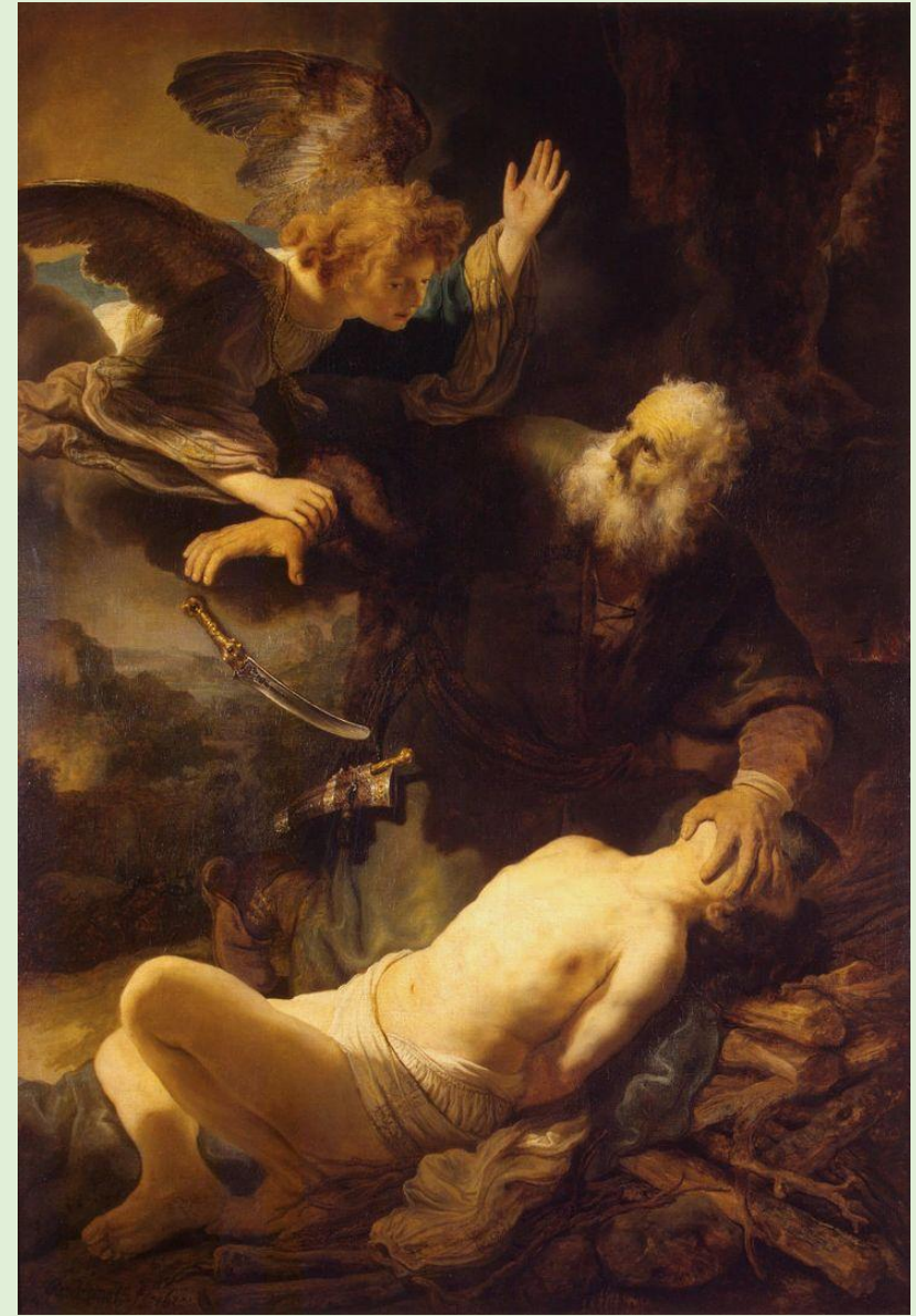
«Sacrifice of Abraham», 1635