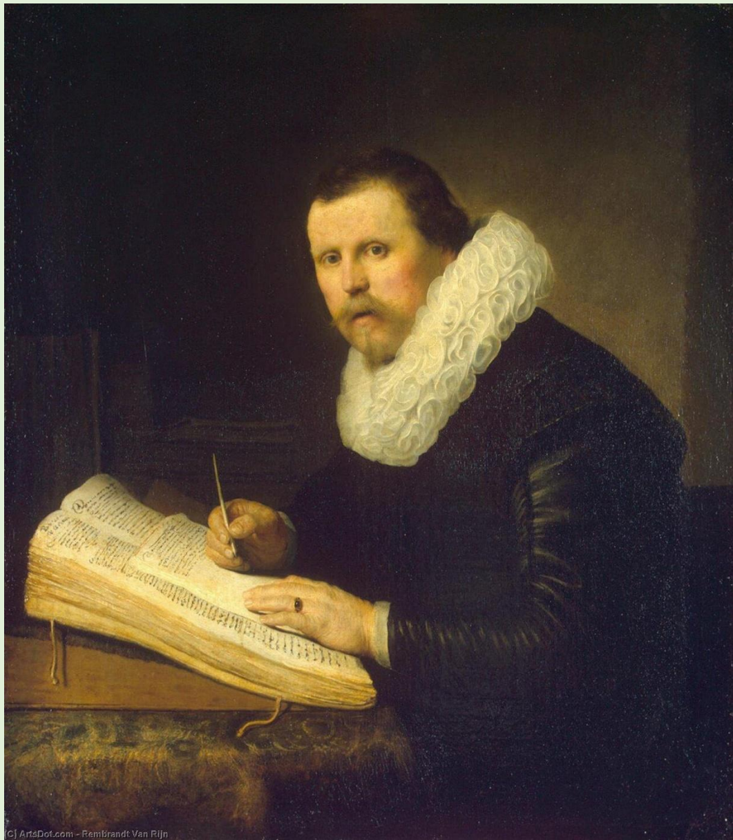
«Portrait of Scholar», 1631