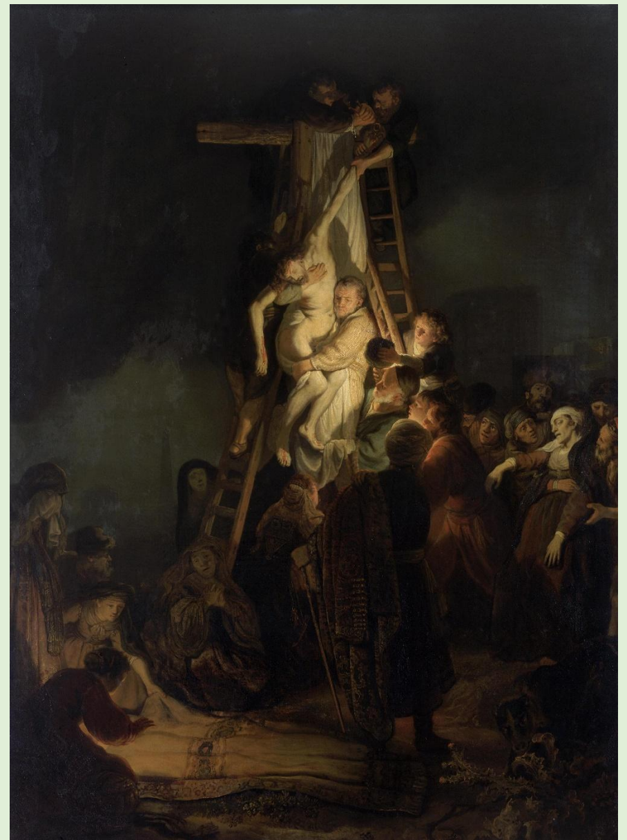
«Descent from the Cross», 1634