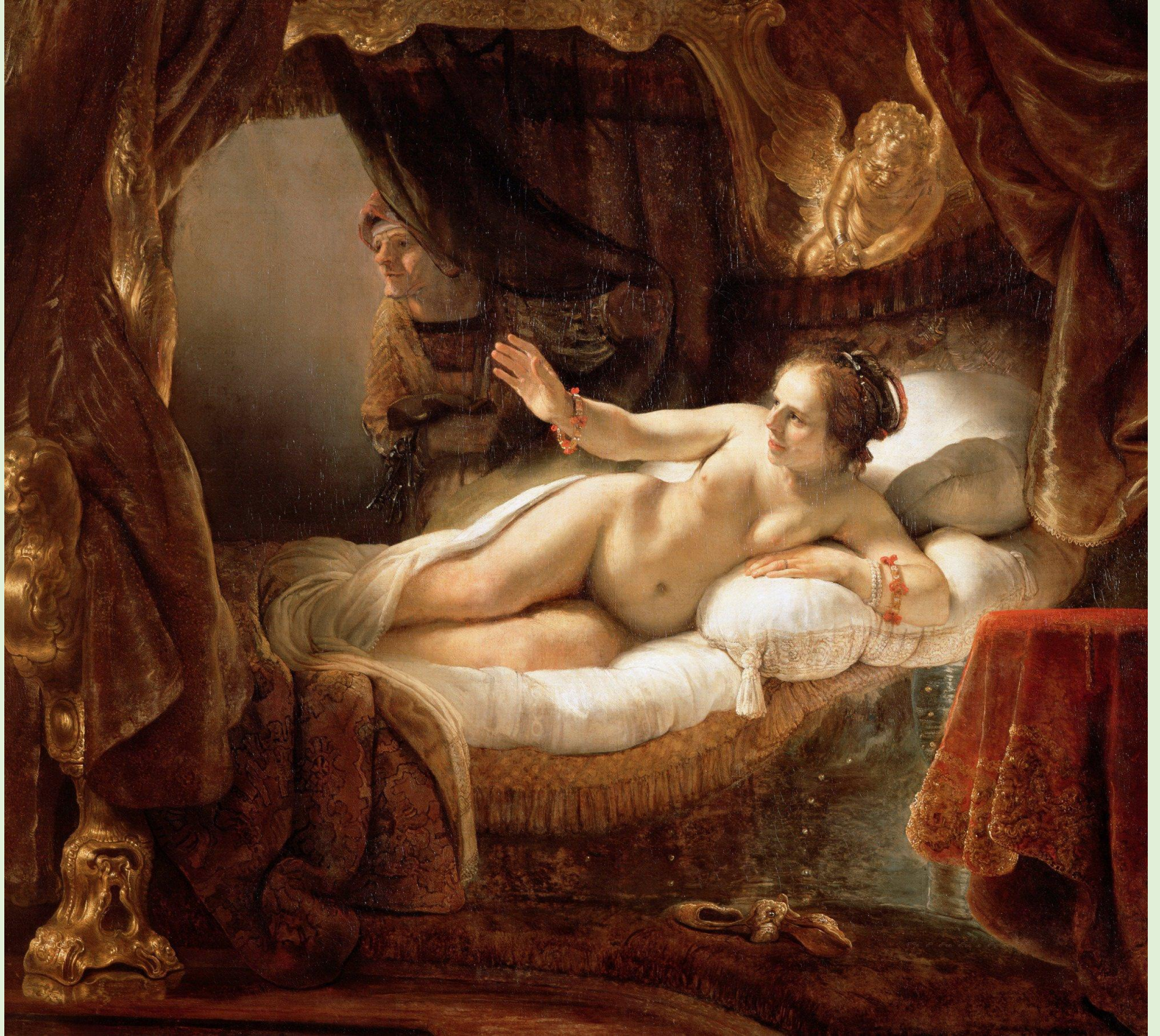
«Danae», 1636 – 1647