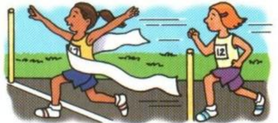
6. won a race