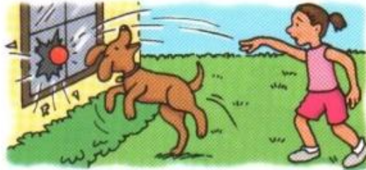
2. broke a window