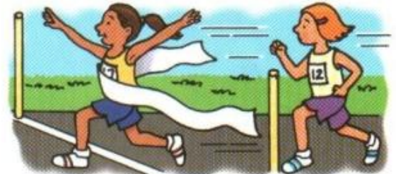
6. won a race