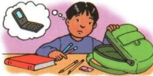
5. lost his cell phone