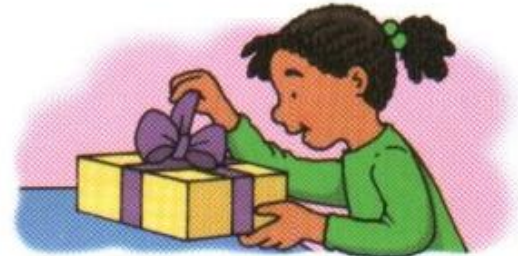
3. got a present