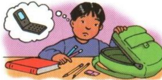
5. lost his cell phone