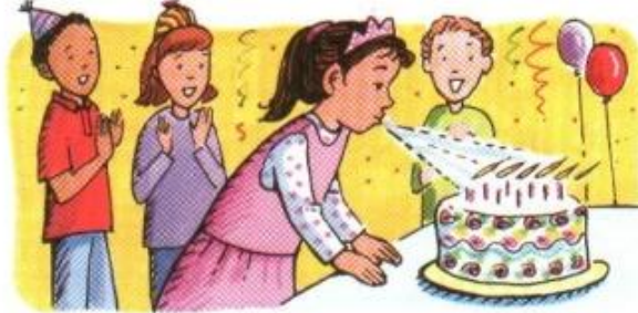
2. had a party