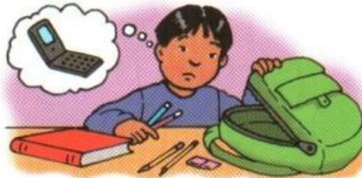
5. lost his cell phone