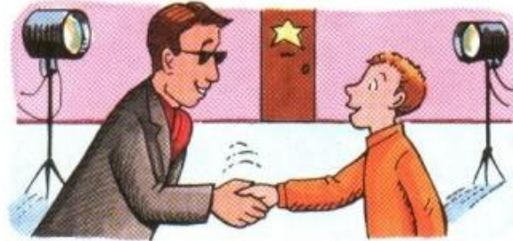
5. met a movie star