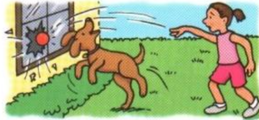
2. broke a window