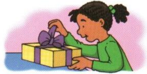
3. got a present