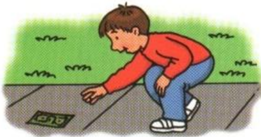
4. found some money