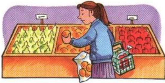
4. went to the store