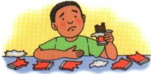
1. ate too much chocolate