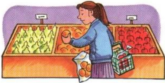
4. went to the store