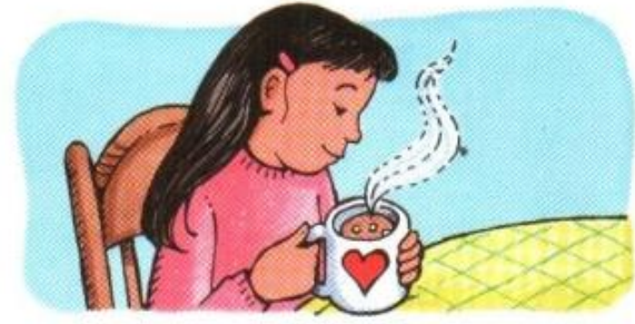
6. drank hot chocolate.