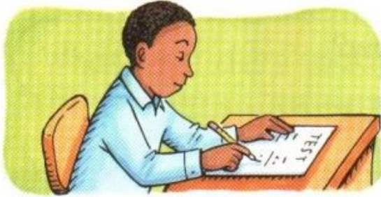
1. took a test