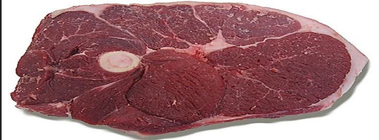
..... of meat.