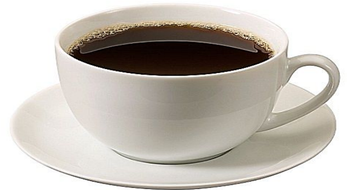
..... Of coffee.