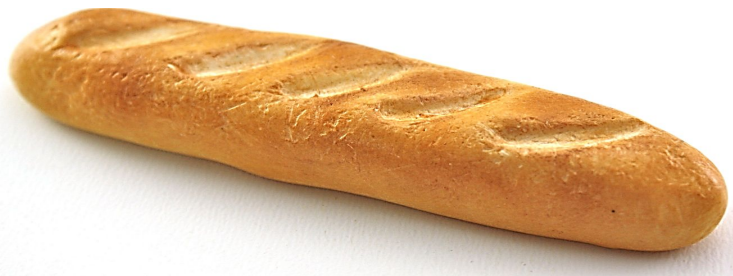
..... of bread.