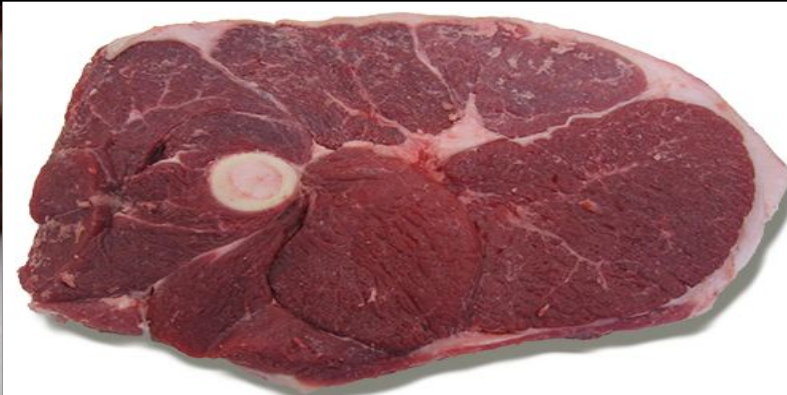
A slice of meat.