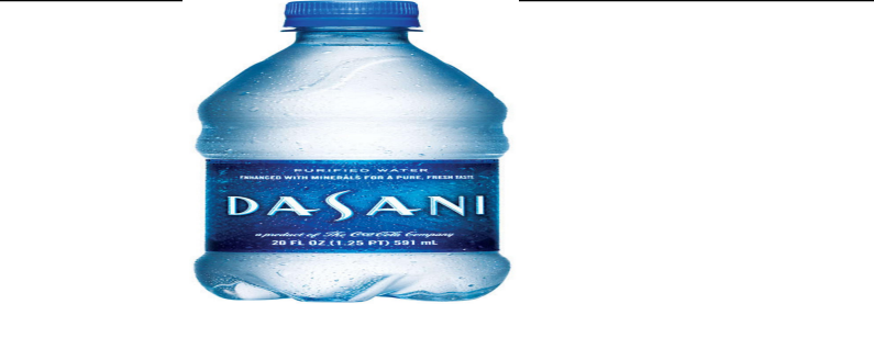
..... of water.