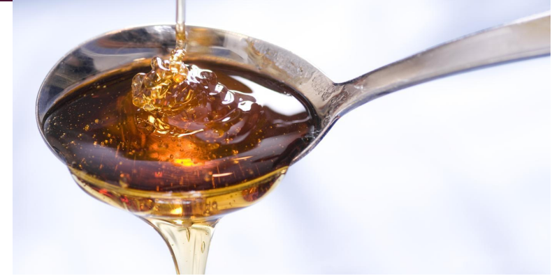
A teaspoon of honey.