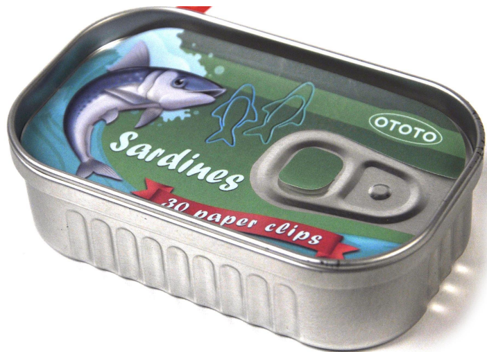
A tin of sardines.