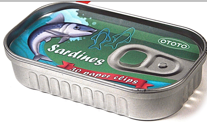
..... Of Sardines.