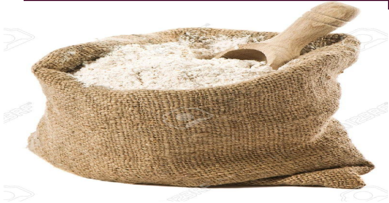
A bag of flour.