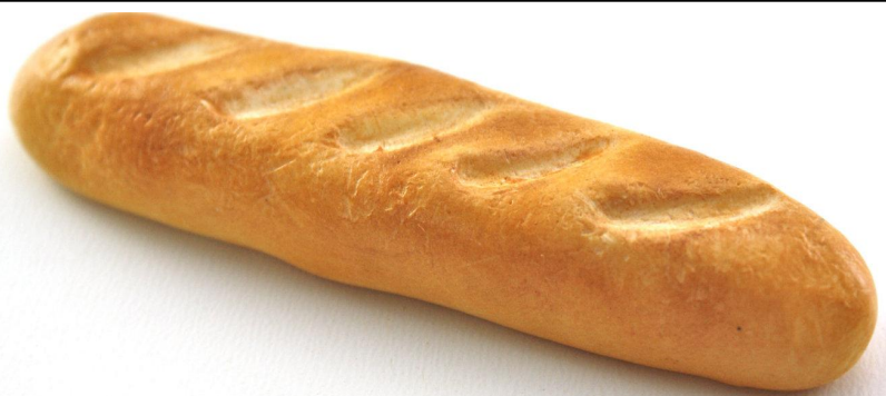
A loaf of bread.