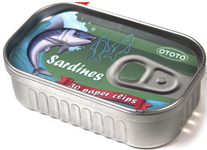
A tin of sardines.