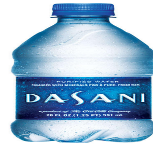
A bottle of water.