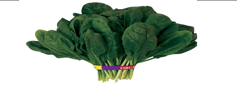
..... of spinach.