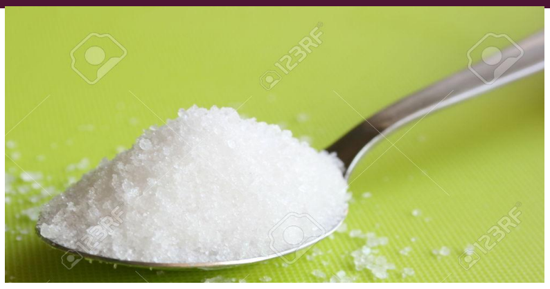
..... of salt.