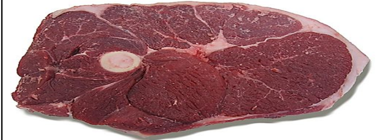
..... of meat.