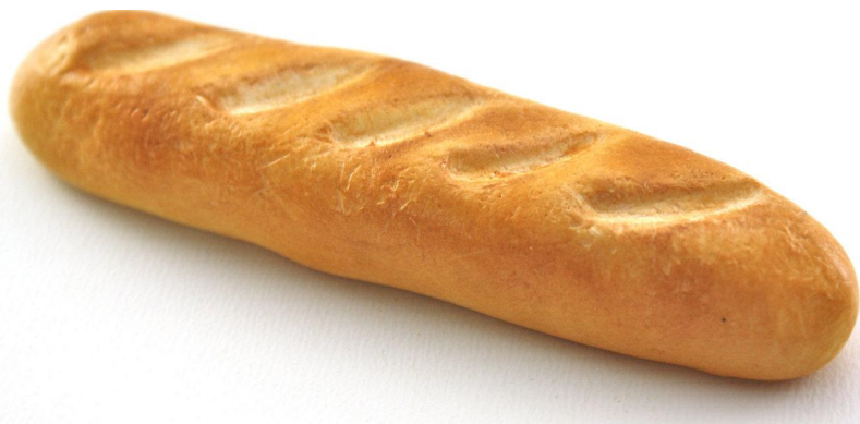
A loaf of bread.