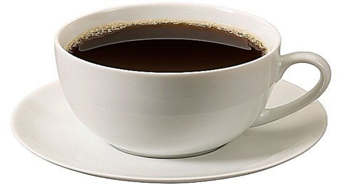
..... Of coffee.