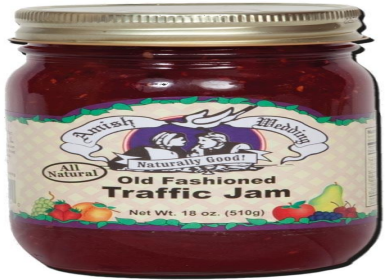
A jar of jam.