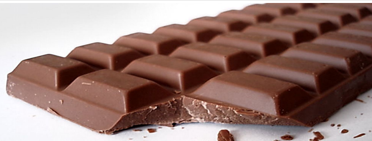
..... Of chocolate.