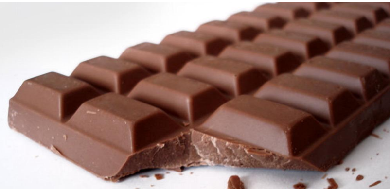
A bar of chocolate.