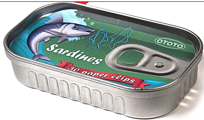
..... Of Sardines.