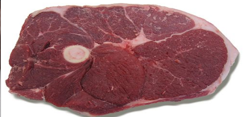
A slice of meat.