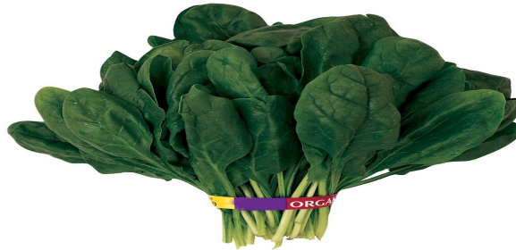
A bunch of spinach.