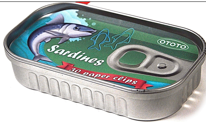
..... Of Sardines.