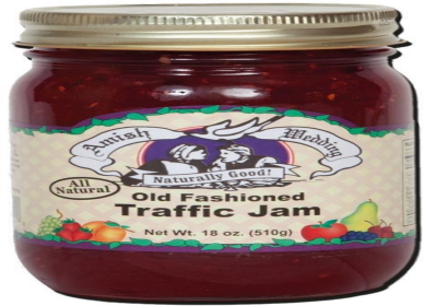
A jar of jam.