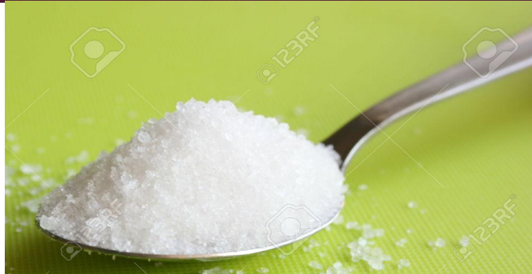
A spoonful of salt.