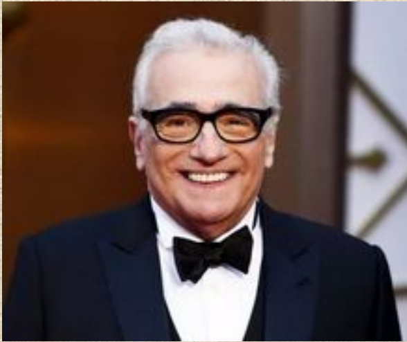
Martin Scorsese/ Italian? Where/from?