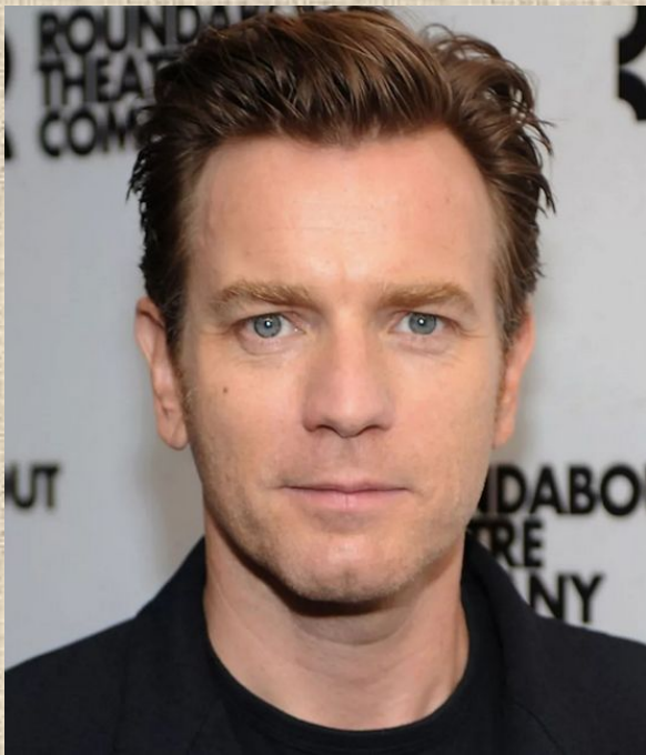
Ewan McGregor, Irish? Where/from?