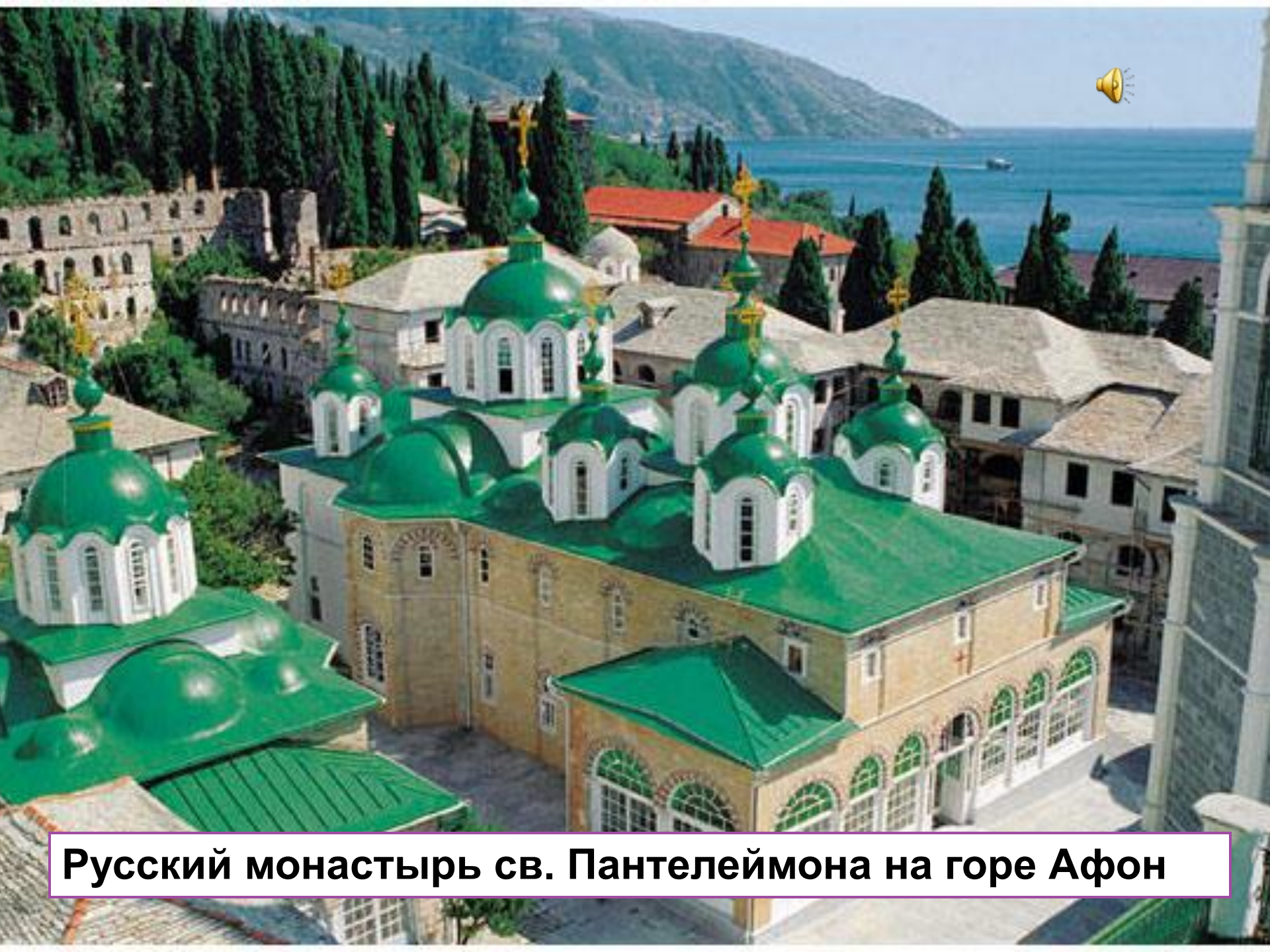
Русский монастырь св. Пантелеймона на горе Афон