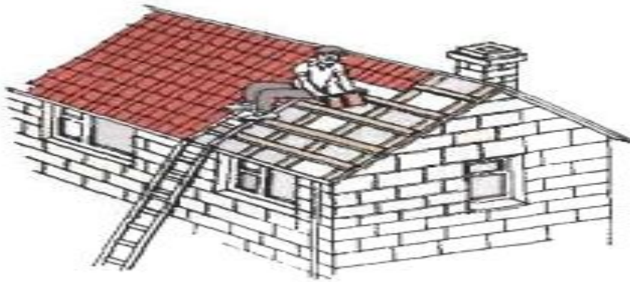
There's a man on the roof.

SUNDAY MONDAY TUESDAY WEDNESDAY THURSDAY FRIDAY SATURDAY