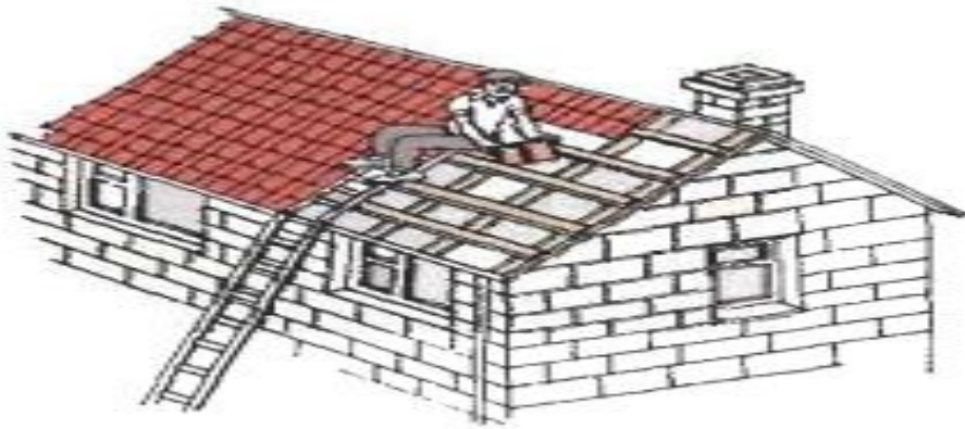
There's a man on the roof.

SUNDAY MONDAY TUESDAY WEDNESDAY THURSDAY FRIDAY SATURDAY