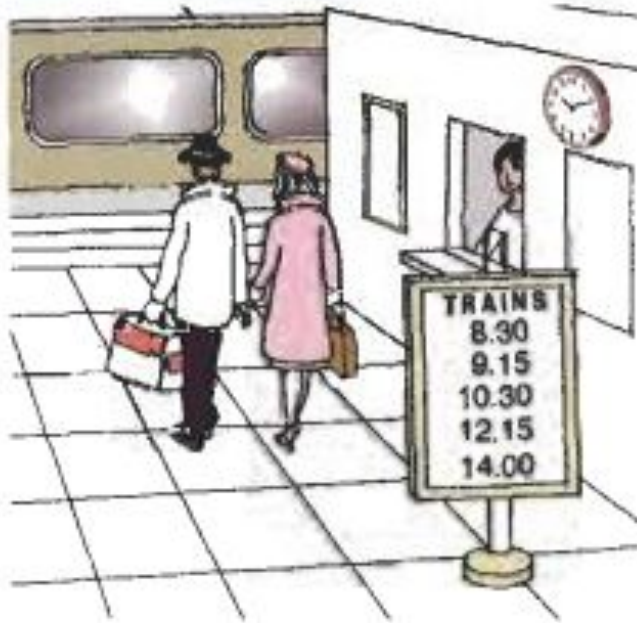
There's a train at 10.30.

= a man is on the roof = a train leaves at 10.30 = a week consists of 7 days