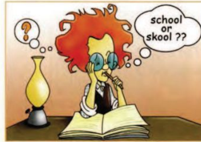
Albert Einstein couldn't spell.

Could is the past simple of the verb 'can'.