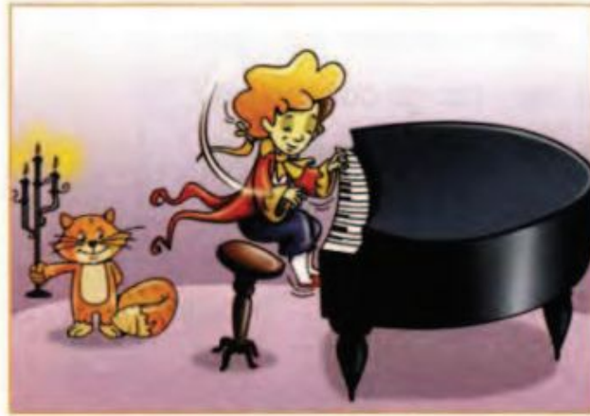
Amadeus Mozart could play the piano when he was four.