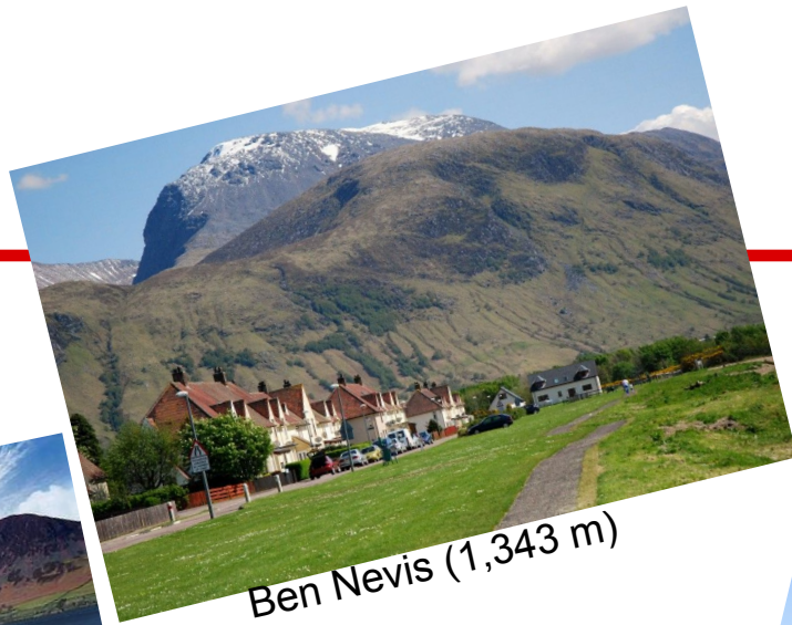
Ben Nevis (1,343 m)