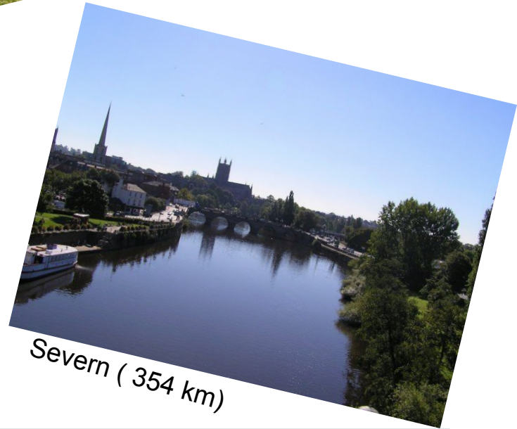
Severn ( 354 km)