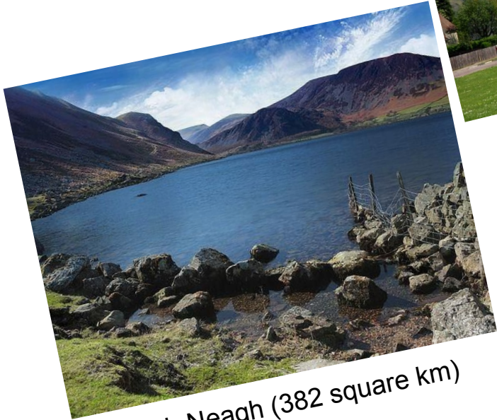
Lough Neagh (382 square km)