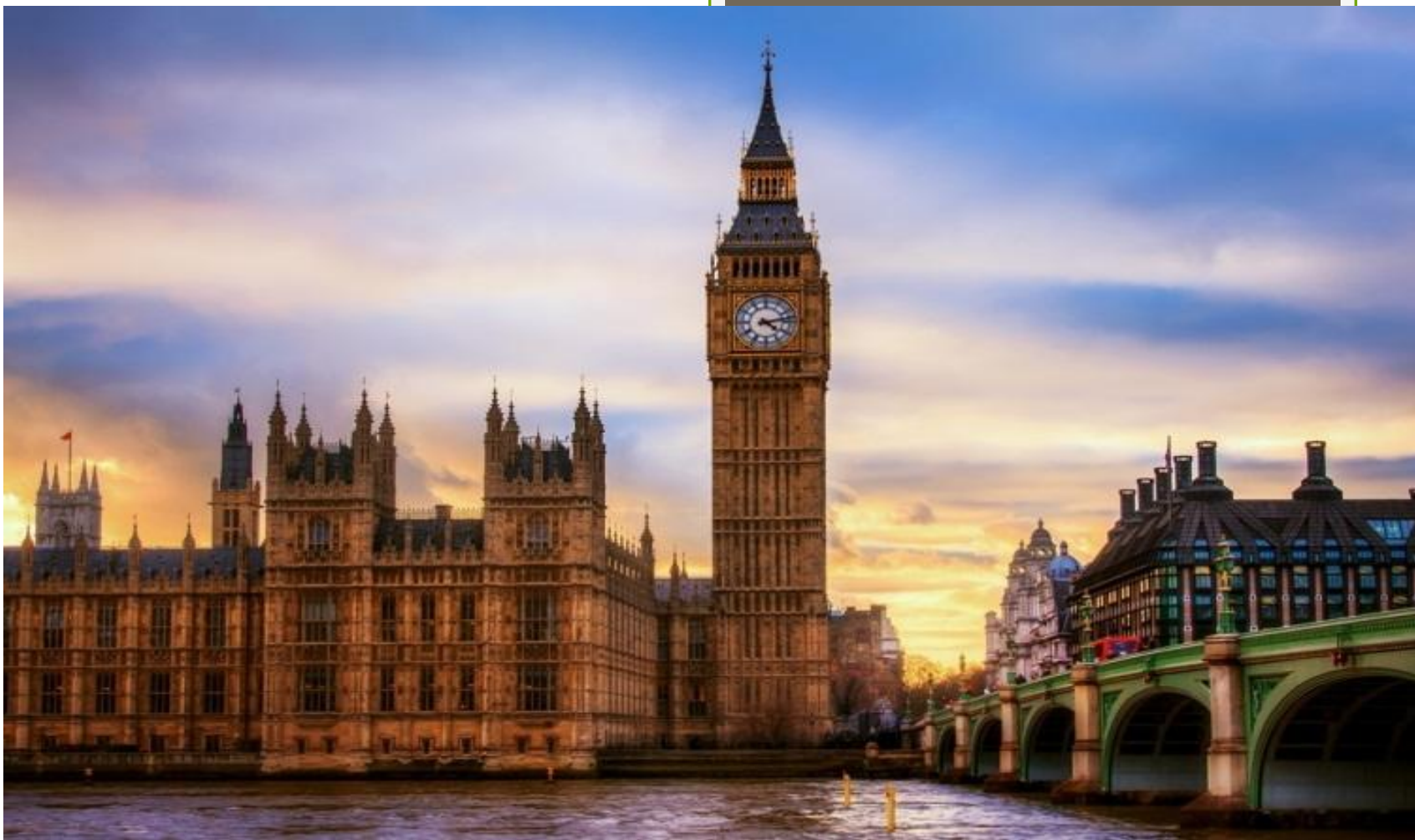
Big-Ben — a bell tower in London, a part of an architectural complex of the Westminster palace. The official name — «the Hour tower of the Westminster palace», also it name «the Tower of St. Stefana».