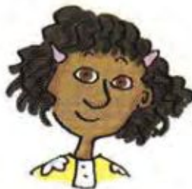
Ann tennis chicken blue