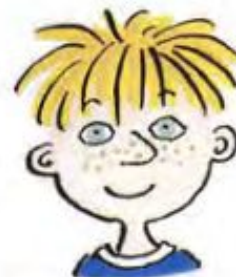
Ken football steak blue