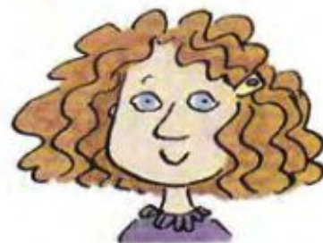
Kate tennis chicken red