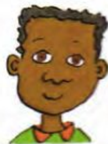
Ali football spaghetti red