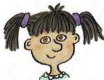
Layla swimming pizza blue