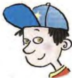
Alex basketball spaghetti red