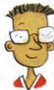
Mike basketball chicken blue