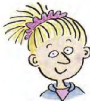
Liz swimming pizza red