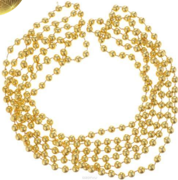
New year's beads