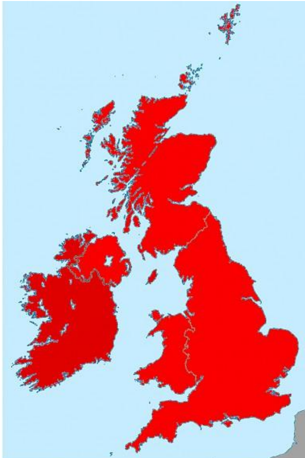
The British Isles