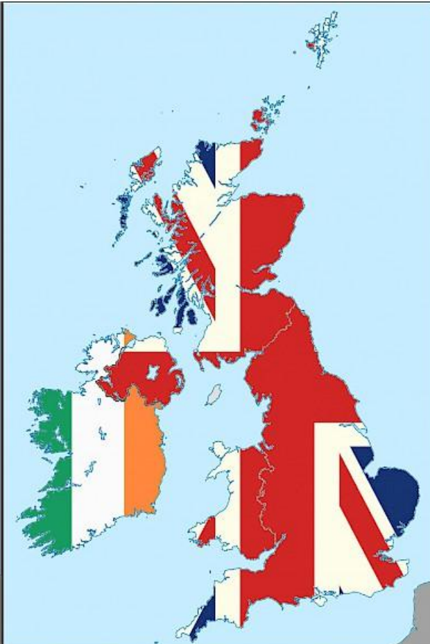
The U.K. and Ireland