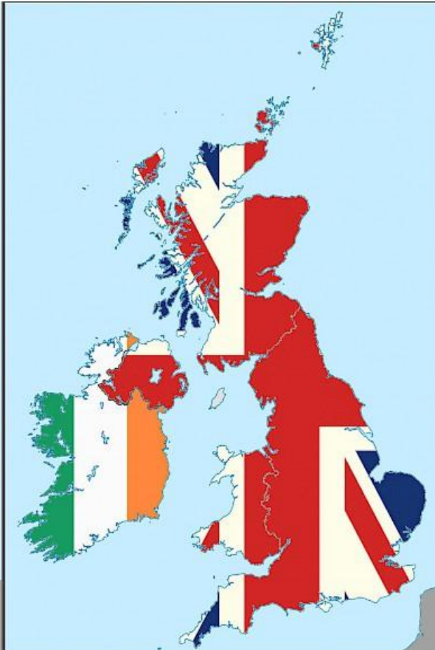
The U.K. and Ireland