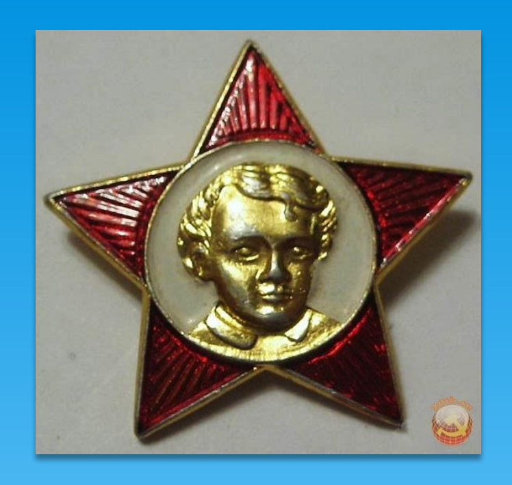
Order of October

They began to gather for meetings of the «stars» when they made their first plans of work,reported on what had been done,and made promises.Leaders of the October were the Pioneers