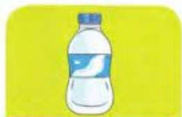
bottle of water