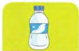
bottle of water