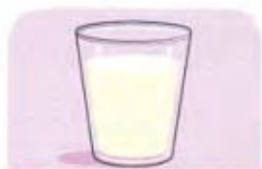
glass of milk