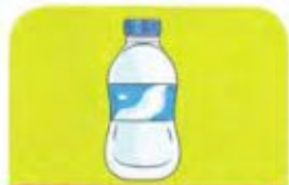
bottle of water