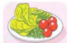
plate of salad