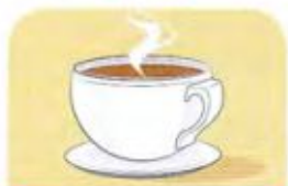
cup of coffee