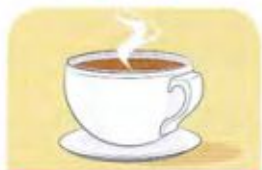
cup of coffee