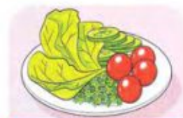
plate of salad