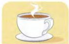
cup of coffee