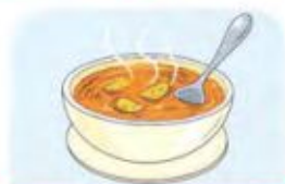
bowl of soup