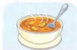
bowl of soup