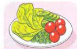
plate of salad