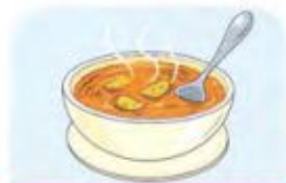
bowl of soup