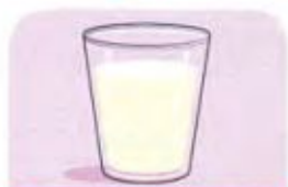
glass of milk