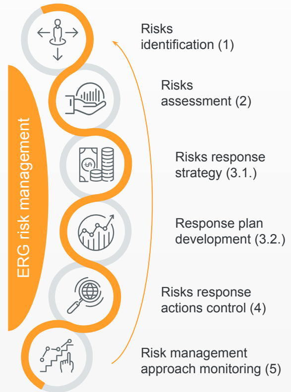
Diagram 2. ERG risk management approach

ERG risk management framework is overseen by the Board and the Executive Committee. ERG-wide risk management policy sets governing principles and corporate objectives for the risk management processes at ERG. Further application of these principles is channeled to all ERG assets, including AoK and KAS, through detailed methodologies, standards and guidelines.