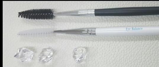
Screw lash comb