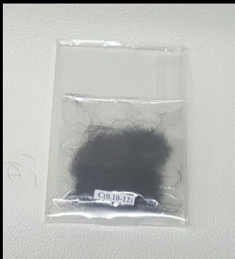
Black pack lash

We can supply all eyelashes-related products