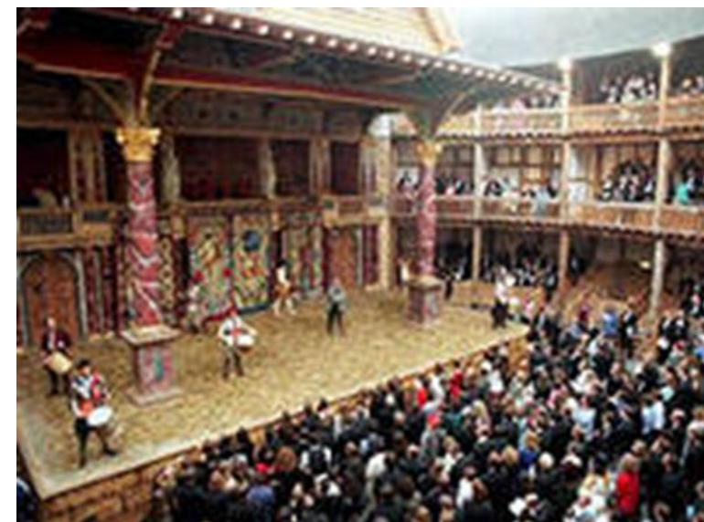
Shakespeare's Globe Theatre