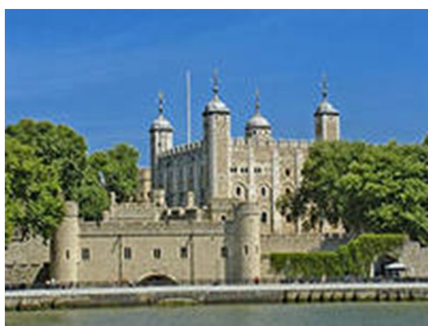
The Tower of London