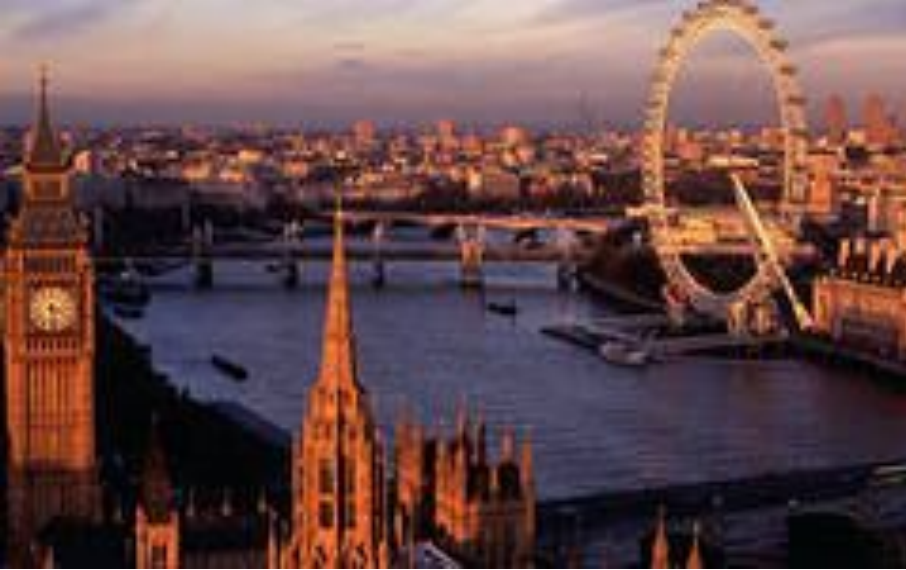
The London Eye