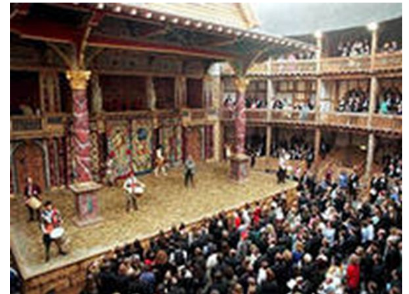
Shakespeare's Globe Theatre