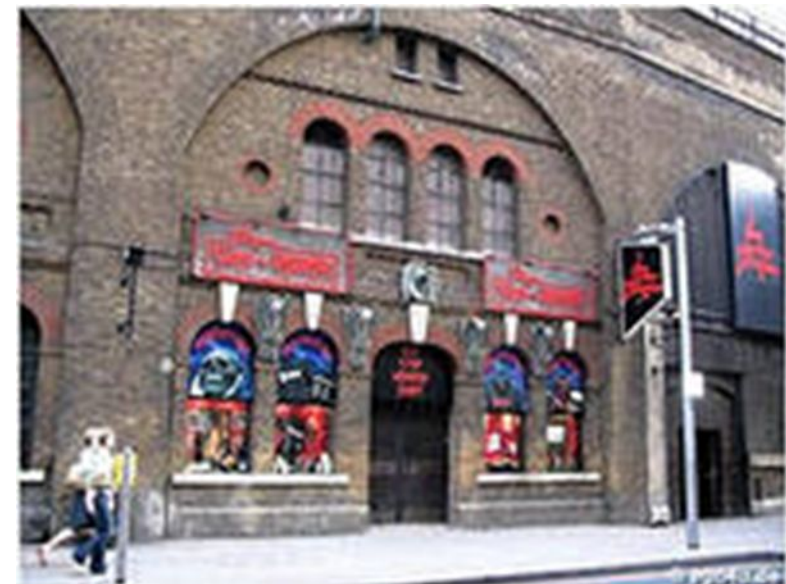
The London Dungeon ['dʌndʒ(ə)n]