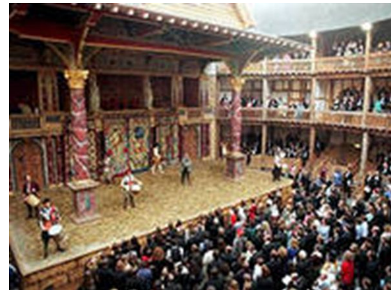
Shakespeare's Globe Theatre