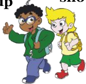
He goes to school