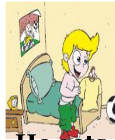
He gets dressed