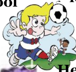
He plays with his friends