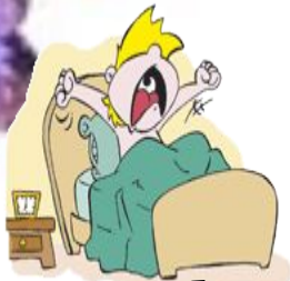
He wakes up