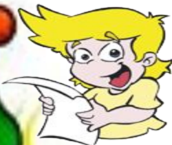
He does his homework