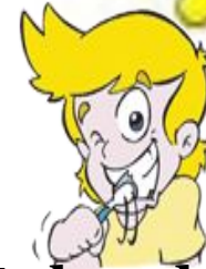
He brushes his teeth