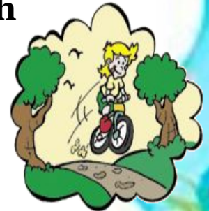
He goes back home