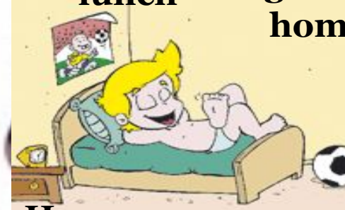
He goes to bed