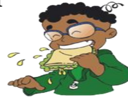
He has lunch