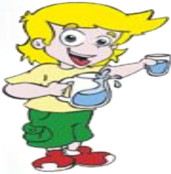
He has breakfast