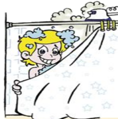
He has a shower