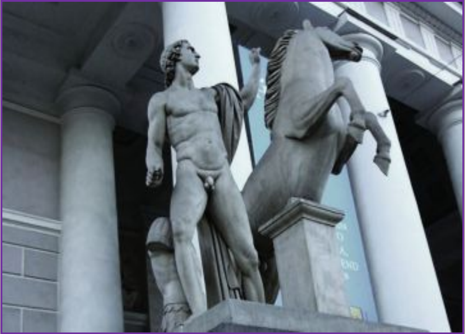
The stairs are graced with two marble sculptures of Dioscuri.