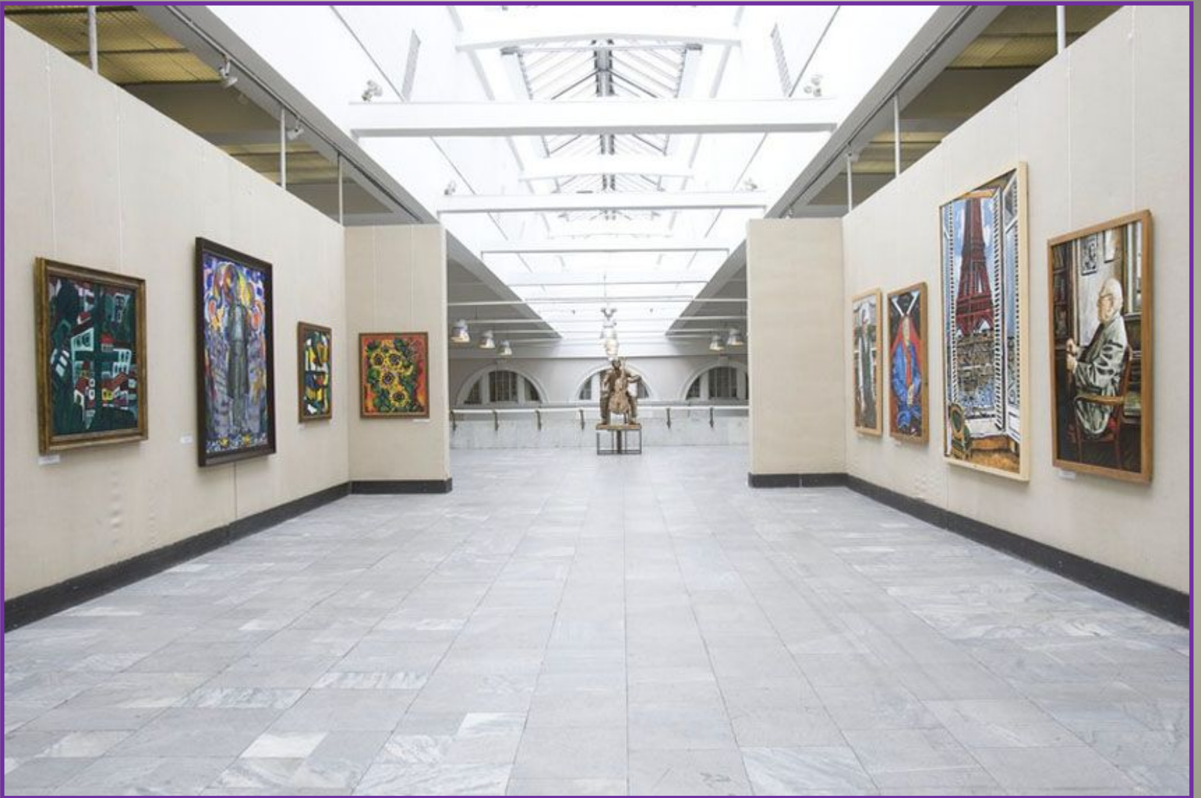
Nowadays, the Manege building houses the exhibition hall of the Union of Artists