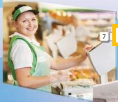
7 shop assistant