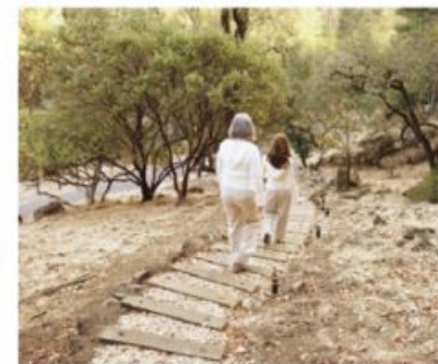
2 down the steps