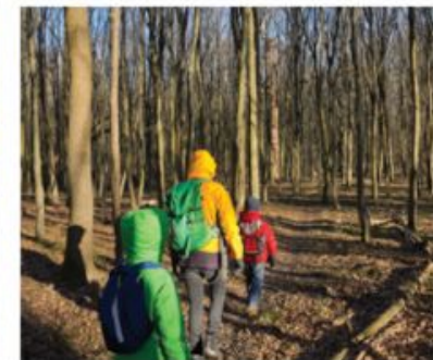
4 through the trees