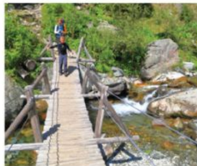
3 over the bridge