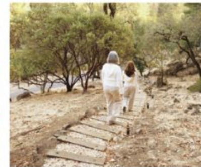
2 down the steps