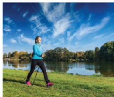
5 along the river