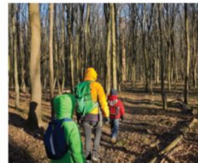
4 through the trees