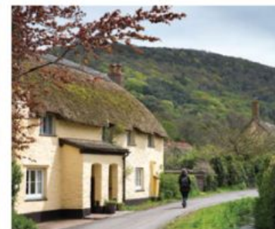
6 past the house