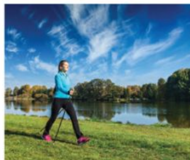
5 along the river