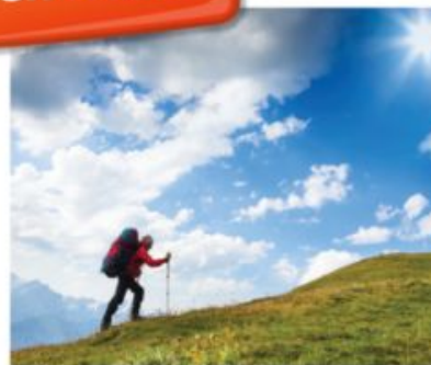
1 up the hill