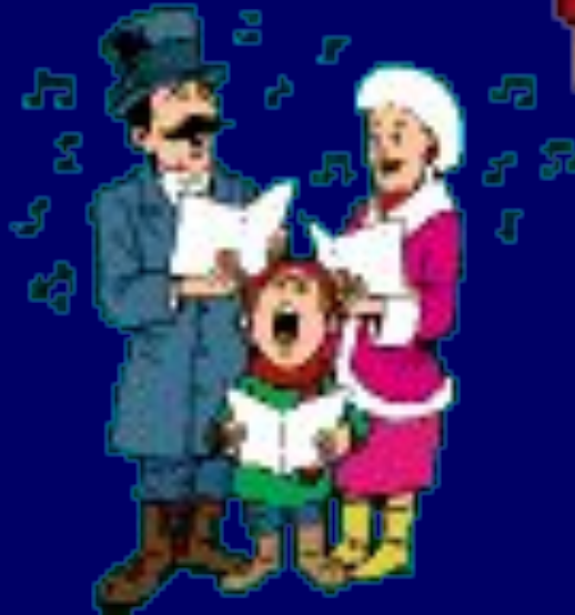
To sing carols