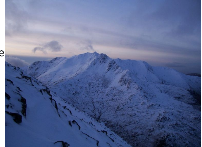
Snow cover on The Saddle in the Scottish Highlands