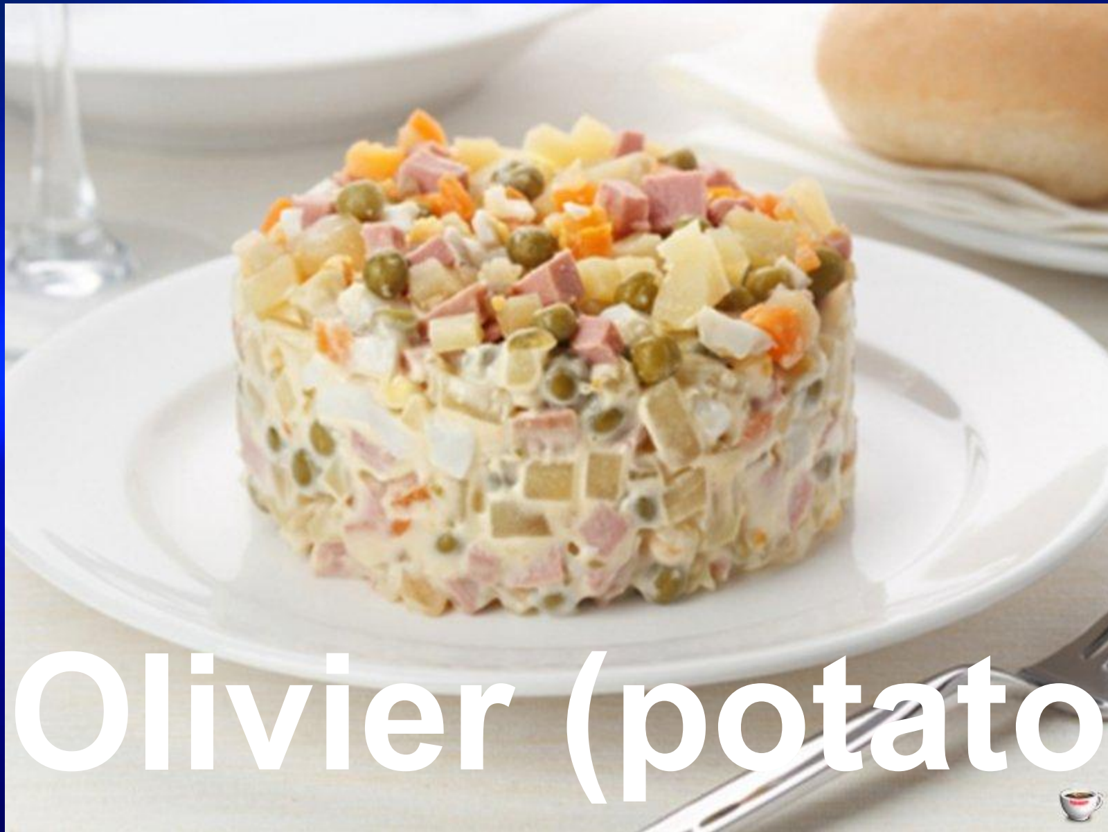
Olivier (potato salad)