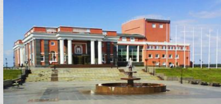
Palace of Arts (Kondopoga)