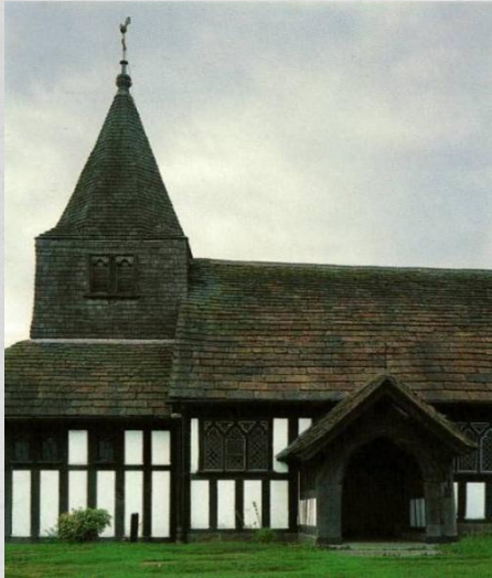
St. James and Paul's church in Marton (United Kingdom)