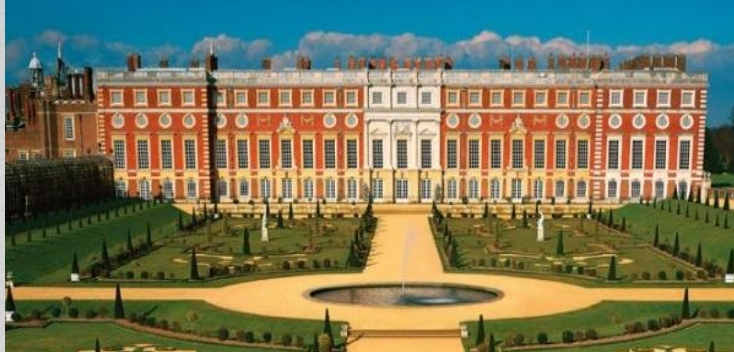
Hampton- Court Palace (United Kingdom)