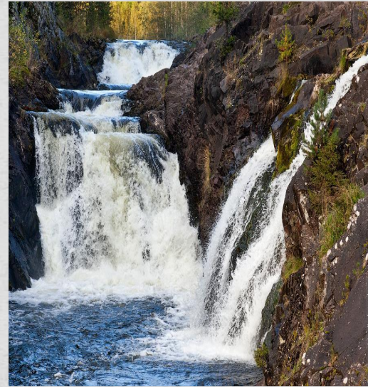
Waterfall Kivach (Kondopoga)