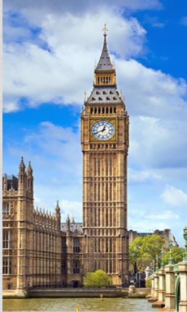
Clock tower of the Palace of Westminster (United Kingdom)