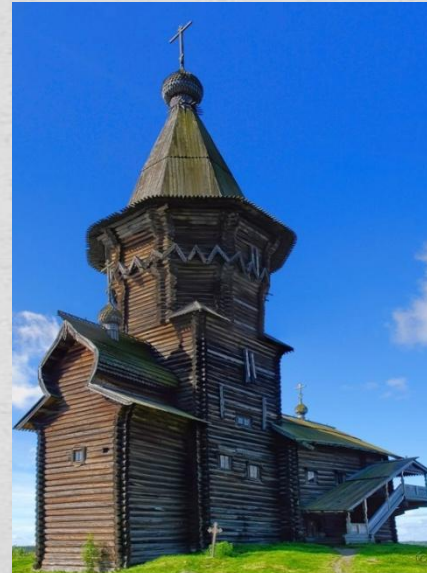
Yspenskaya church (Kondopoga)