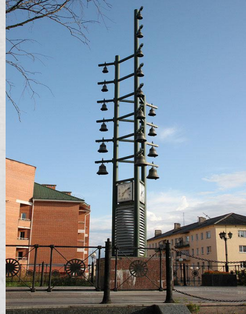
Carillons- city clock with a fight (Kondopoga)