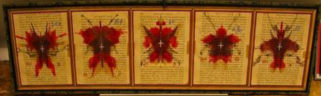
Valva Magis This strange book has talismanen-colours laid on the wax. The talismanen is a mirror des magis. Paris 1584. 1600 (approx). Talismanen-colours on wax-magis. Amsterdam 1660. The museum would like to know more about this book.