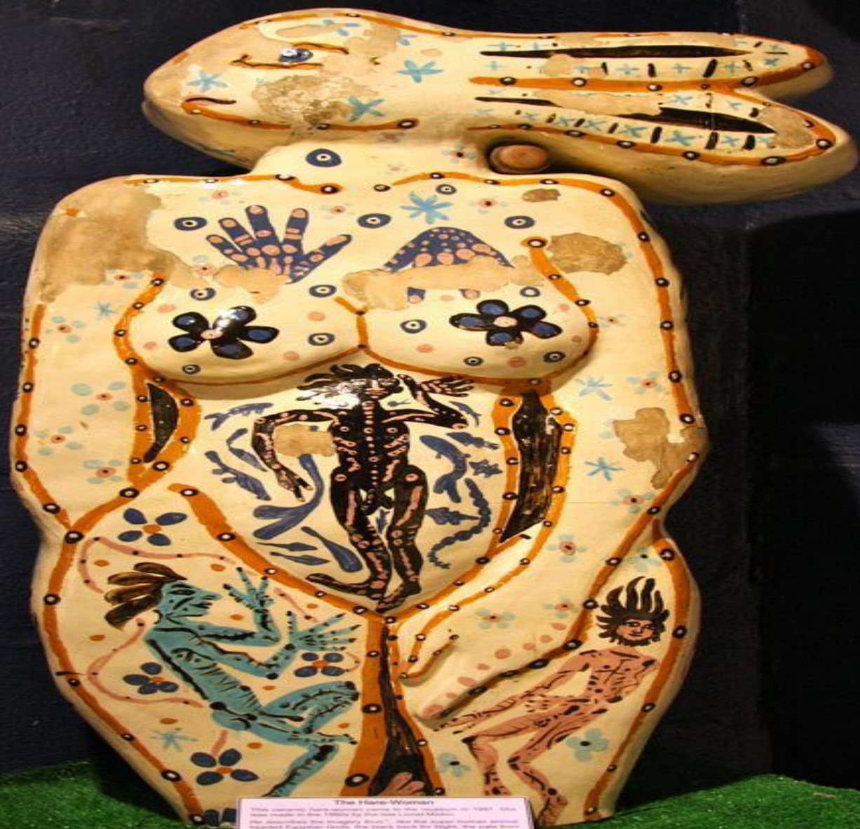
The Hans-Wijeman This ceramic plate was made by the artist in 1987. The plate is made of clay and is decorated with various figures and symbols. The central figure is a black, stylized human figure. Other figures include a blue hand, a blue bird-like creature, and a brown figure with a sun-like head. The plate is surrounded by a decorative border of orange lines and black dots.