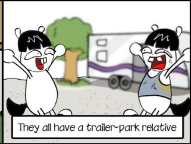
They all have a trailer-park relative