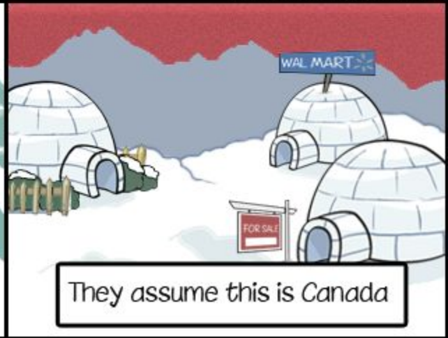
They assume this is Canada