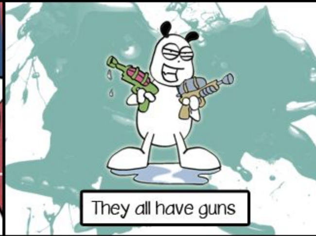
They all have guns