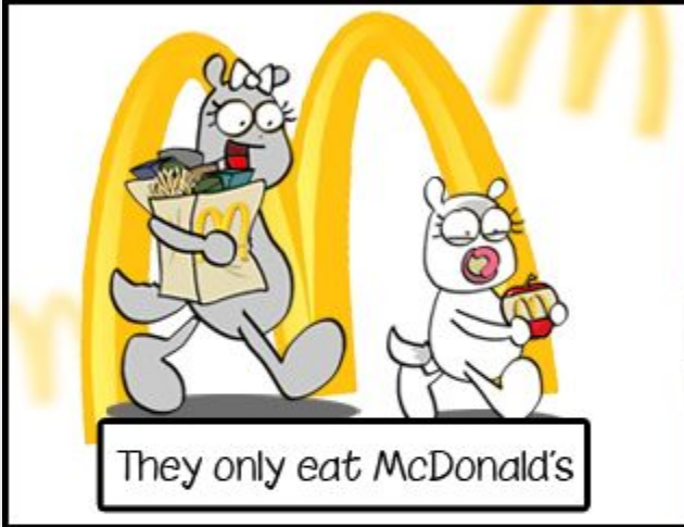
They only eat McDonald's