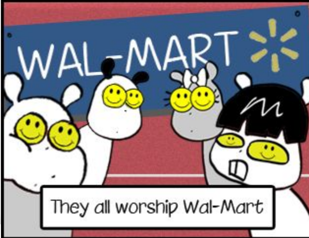
They all worship Wal-Mart