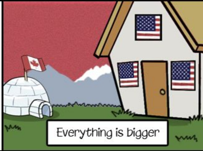
Everything is bigger