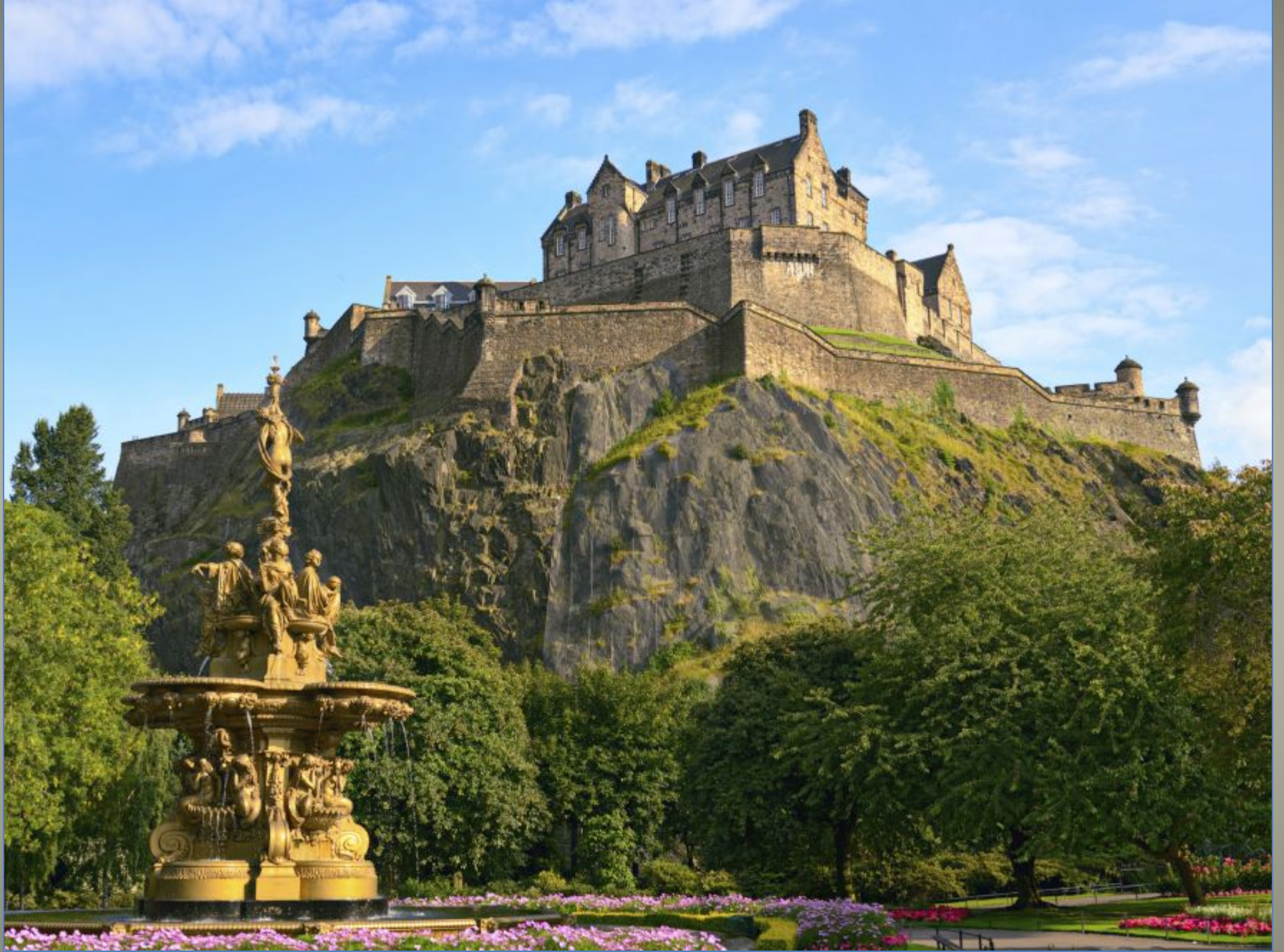
The Castle in Edinburgh