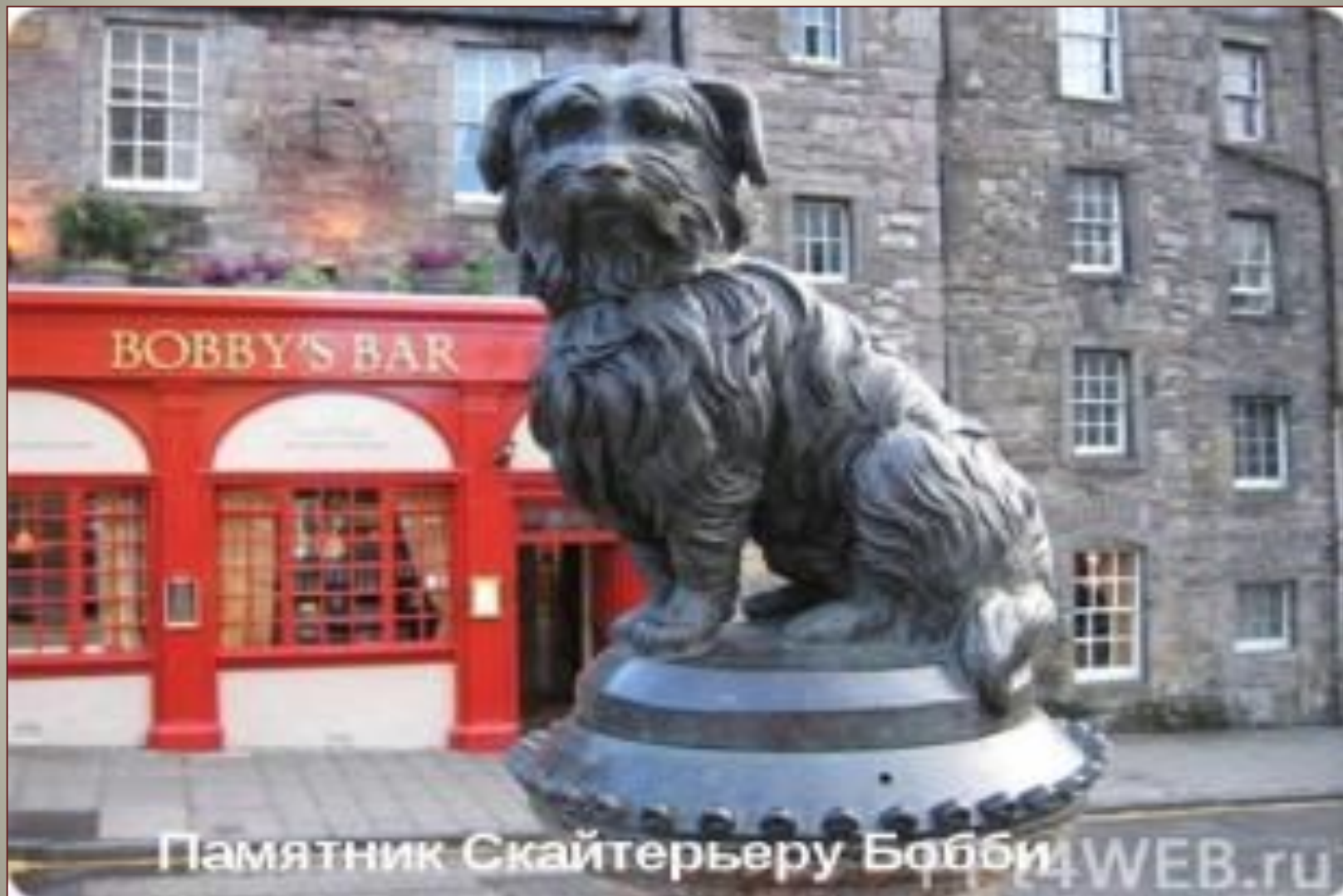
Памятник Скайтерьеру Бобби 4WEB.ru