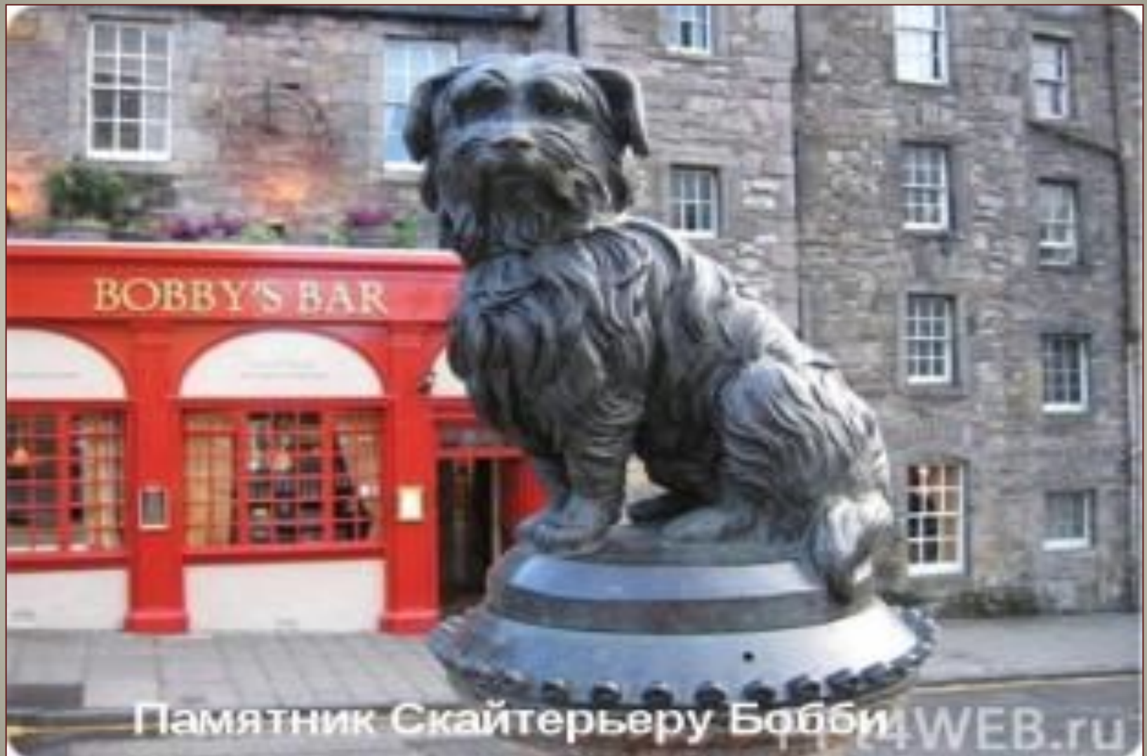
Памятник Скайтерьеру Бобби 4WEB.ru