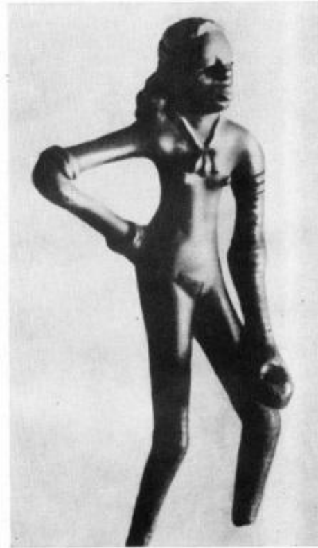
«Таллонияна» из Моленджо-Даро. Черты ее лица характерны для представителей негроидной расы.