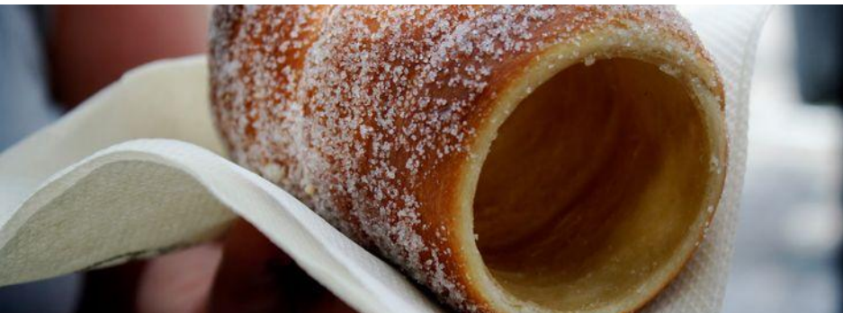
<-- Trdelník, trdlo