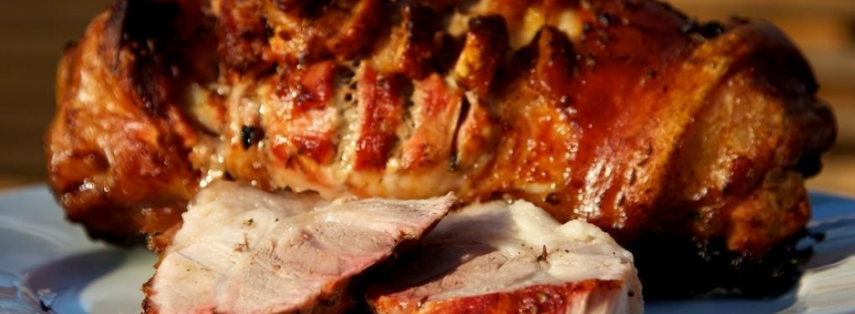
<-- Pečené vepřové koleno