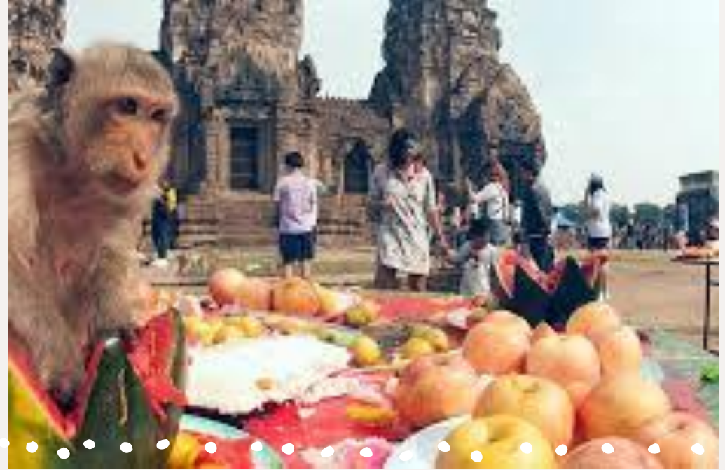
Hanuman –The monkey god