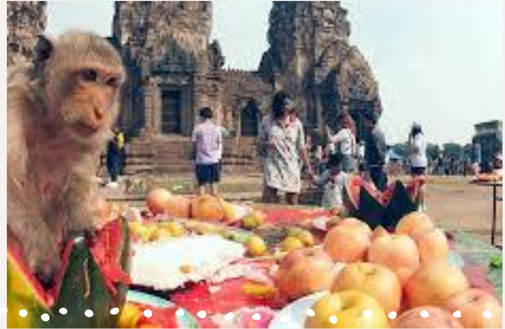
Hanuman –The monkey god