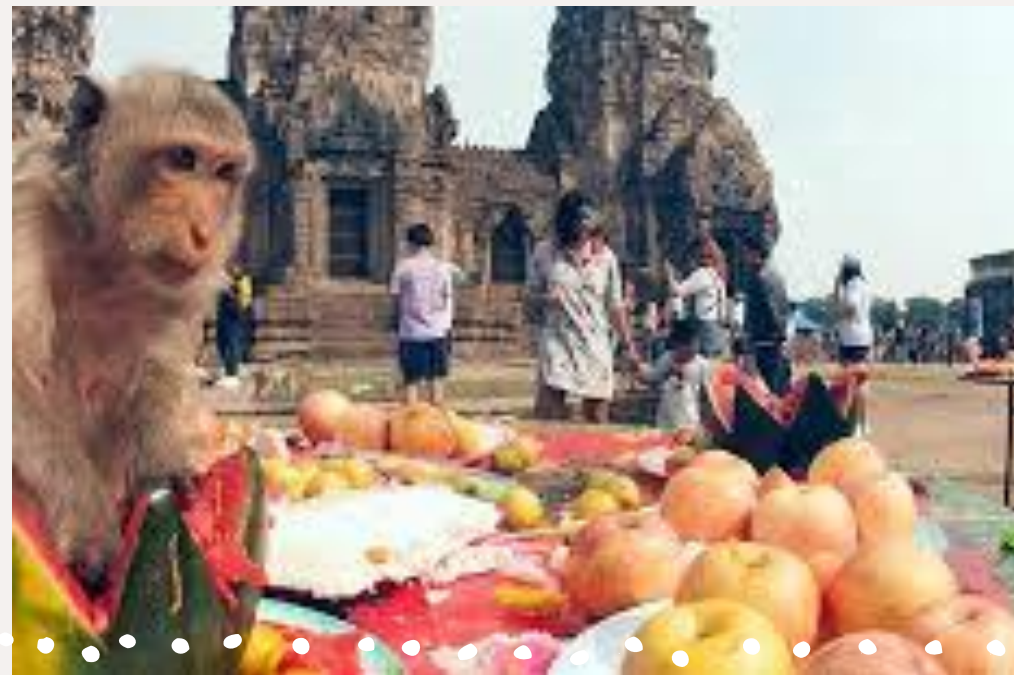
Hanuman –The monkey god