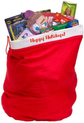
bag of toys