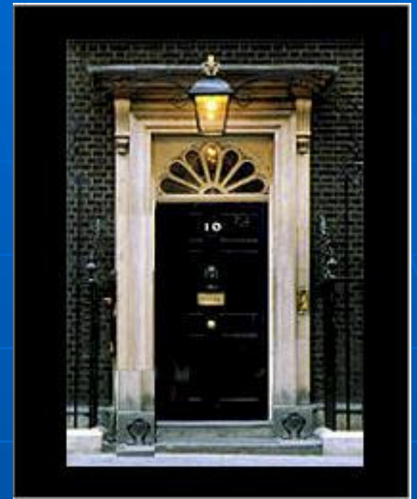
10, Downing Street: the residence of the British Prime Minister