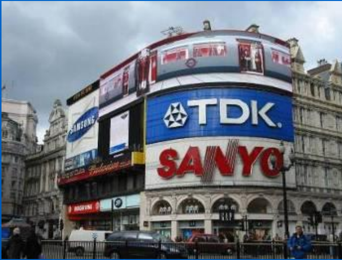
Piccadilly Circus, with its world-famous wall ads