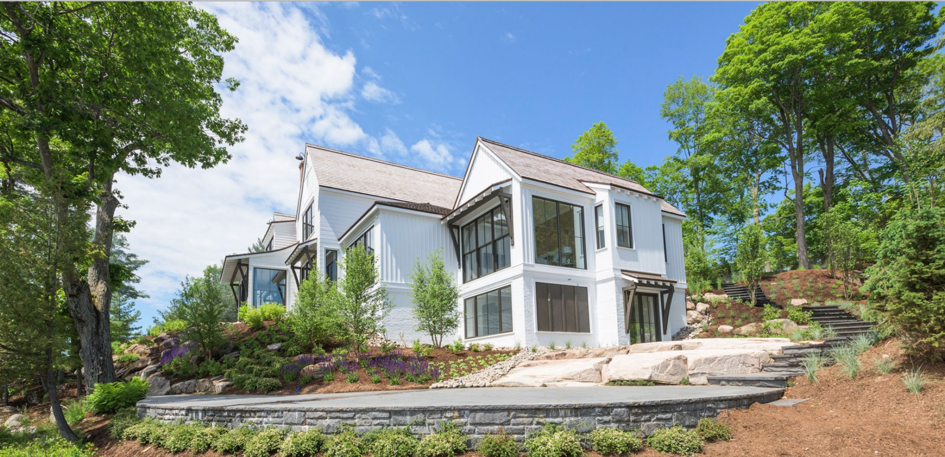
Style of landscaping