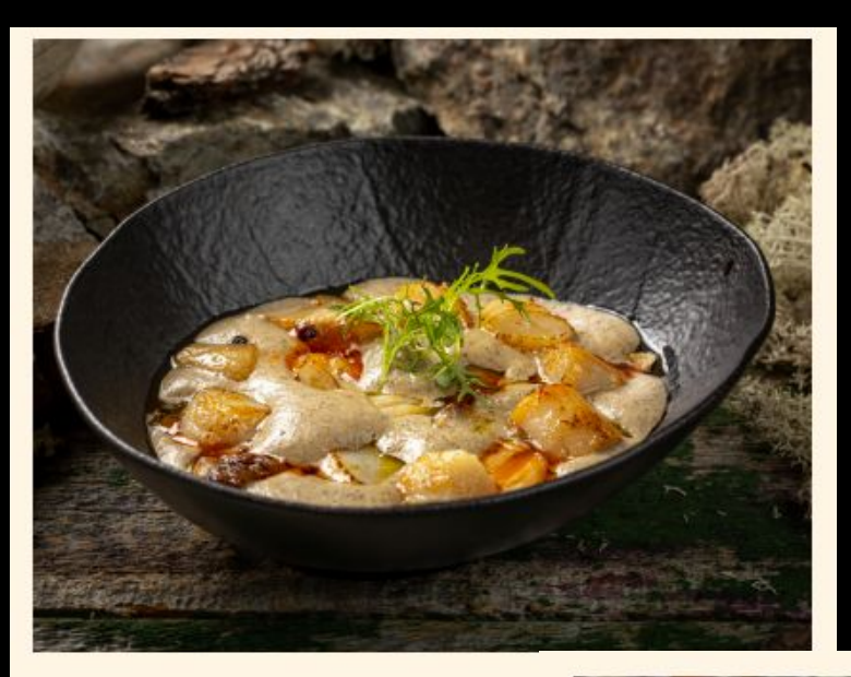
Жареные гребешки с белыми грибами Baked shell Scallops served with algae