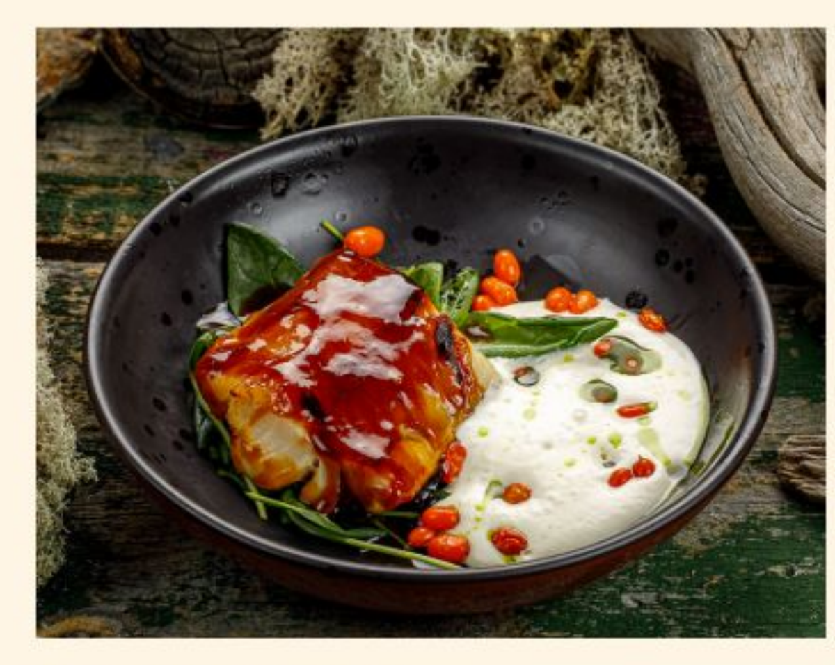
Мурманская треска в терияки с рисовым муссом и облепихой

Roast beef venison with warm smoked potatoes