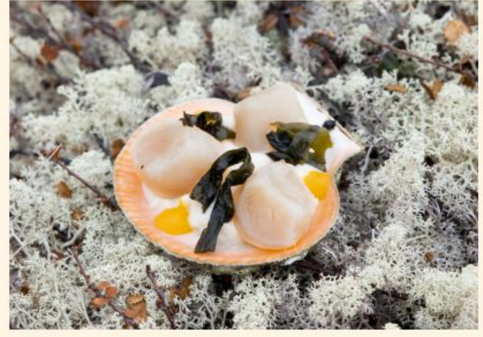
Гребешки, запеченные в раковине с водорослями Baked shell Scallops served with algae (three scallop shells per serving) (в порции 3 раковины с гребешками)