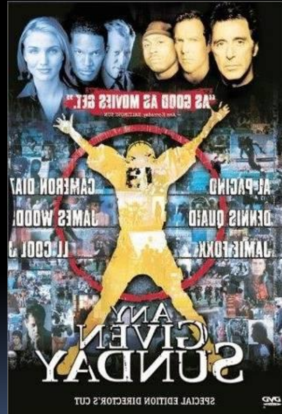
The Sunday Business Post .