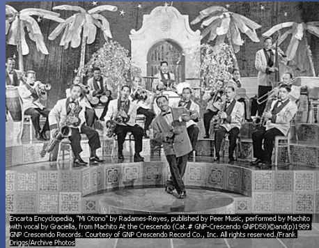
Encarta Encyclopedia, "Mi Otono" by Radames-Reyes, published by Peer Music, performed by Machito with vocal by Graciela, from Machito At the Crescendo (Cat.# GNP-Crescendo GNP058)©and(p)1989 GNP Crescendo Records. Courtesy of GNP Crescendo Record Co., Inc. All rights reserved.