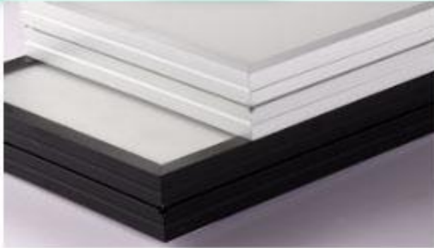
Right Angle Slot