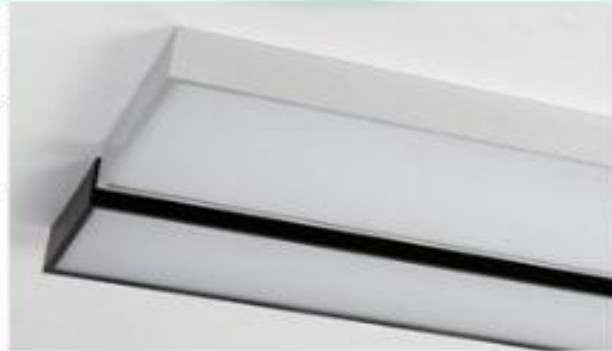
Right Angle Flat Edge