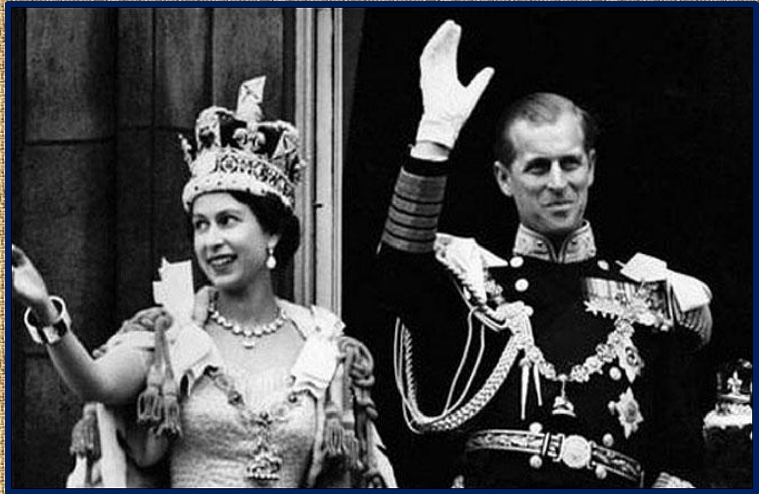
Queen and her husband prince Philip Duke of Edinburgh