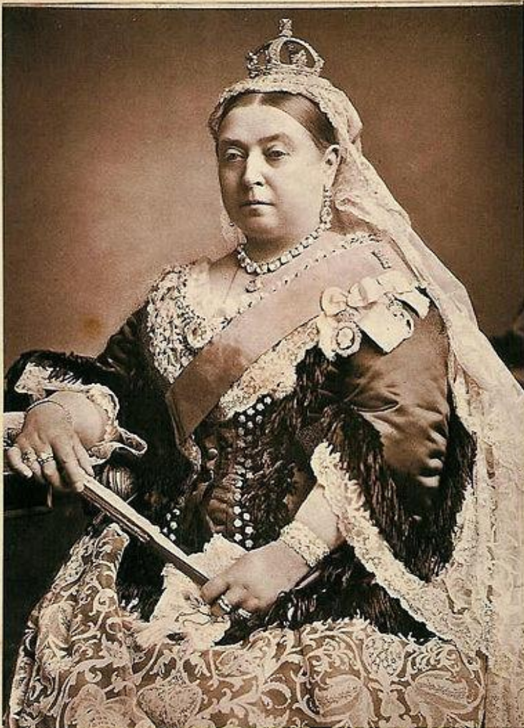
VICTORIA QUEEN OF GREAT BRITAIN EMPRESS OF INDIA 1837—JUBILEE—1887.

Britain became a rich industrial country with a developed trade, an empire with a lot of colonies.