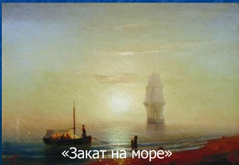
«Закат на море»