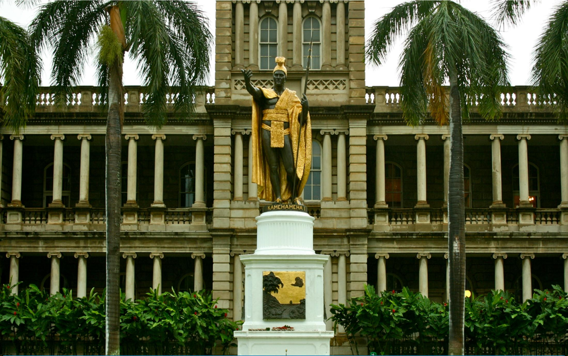
Statue of king Kamehameha I