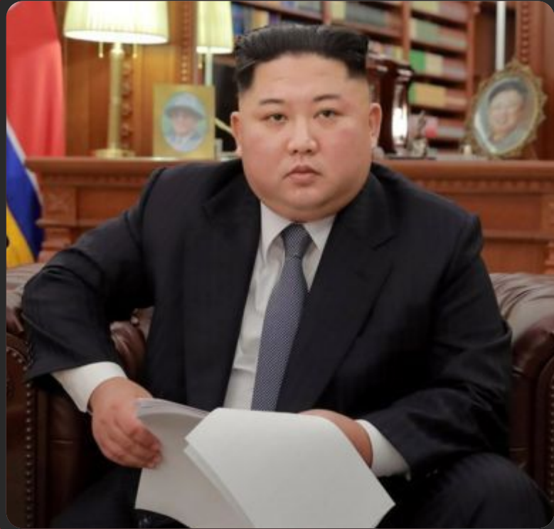
North Korean leader who was born after the country's founding.