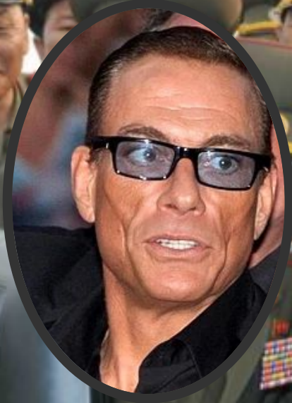
Jean-Claude Van Damme